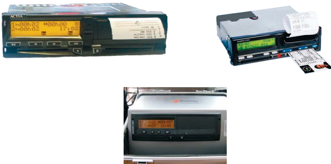
Fig. 1. View of certificated vehicles unit - digital tachograph