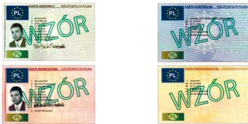
Fig. 2. View of cards in digital tachographs system in Poland