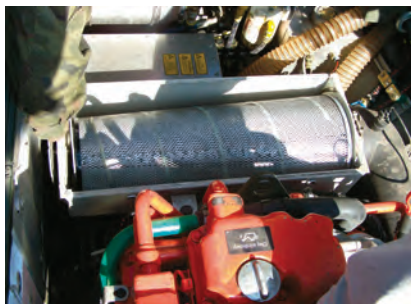
Fig. 5. Air filter view