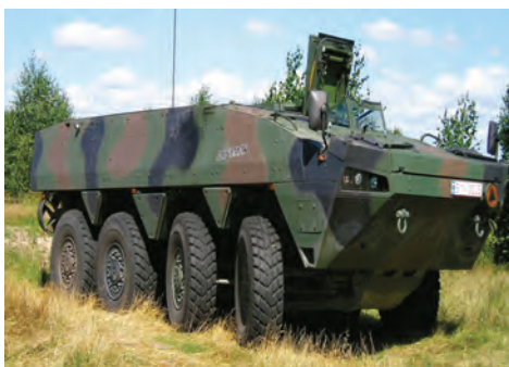
Fig. 1. Vehicle in the basic version

The armoured body protects the vehicle's construction, system and crew from mines. The vehicle can have many versions, e.g. the battle version with a turret system or as a basic vehicle used differently, i.e. as an ambulance, workshop, command vehicle, communication vehicle etc. The vehicle may be transported via railroad, road or via air. Below, the battle and basic versions of the vehicle have been presented (in Fig. 1 and Fig. 2. respectively).