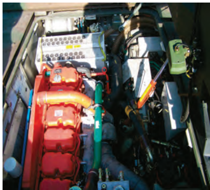
Fig. 3. Overall engine cubicle view

Examples of pictures of unit and elements undergoing servicing are presented below. Fig. 3 shows the overall engine and engine cubicle view, Fig. 4 – auto transmission selector. Fig. 5 presents a partially demounted air filter and Fig. 6 – the view of on-board batteries.