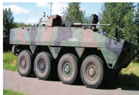
Fig. 2. Vehicle in the battle version

The available literature presenting quite up-to-date data concerning the analyzed topic is mentioned in the following references: normative documents [1, 2, 3, and 13], exploitation-service-repair APC Rosomak details [4-10], APC analyses and comparisons [11, 12, and 14], services and repairs of military vehicles [3, 13, 15-20].