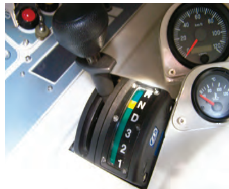
Fig. 4. Auto transmission steering