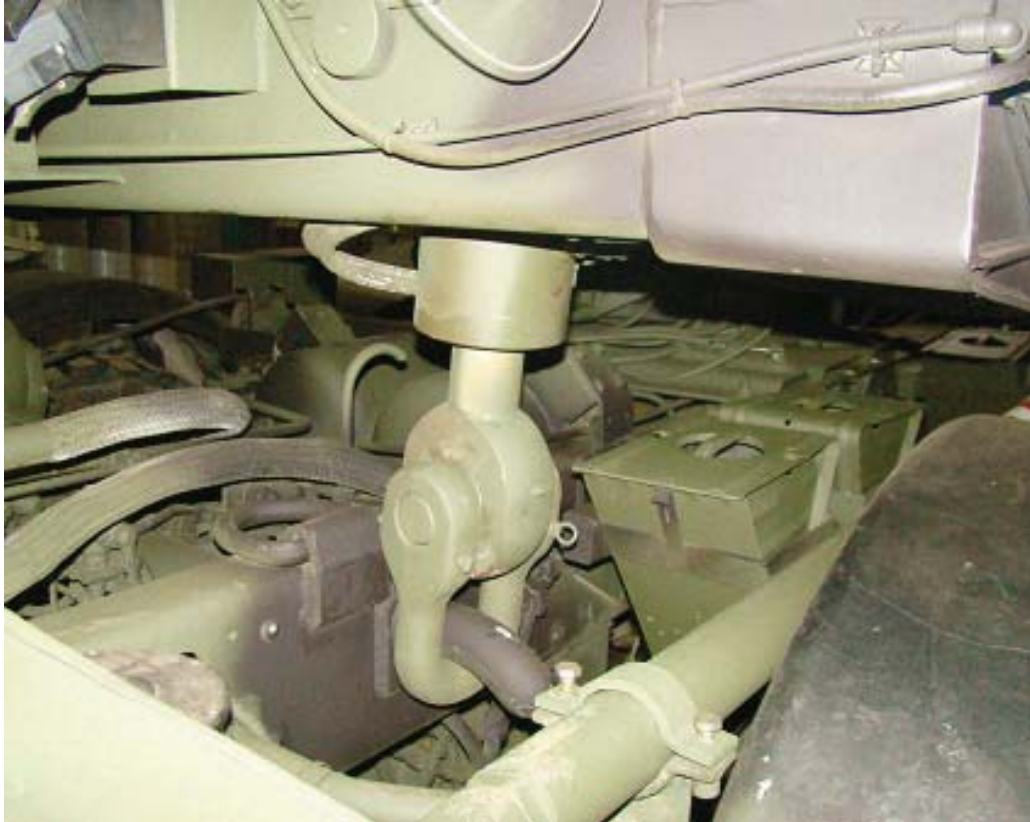
Fig. 12. Coupling mechanism