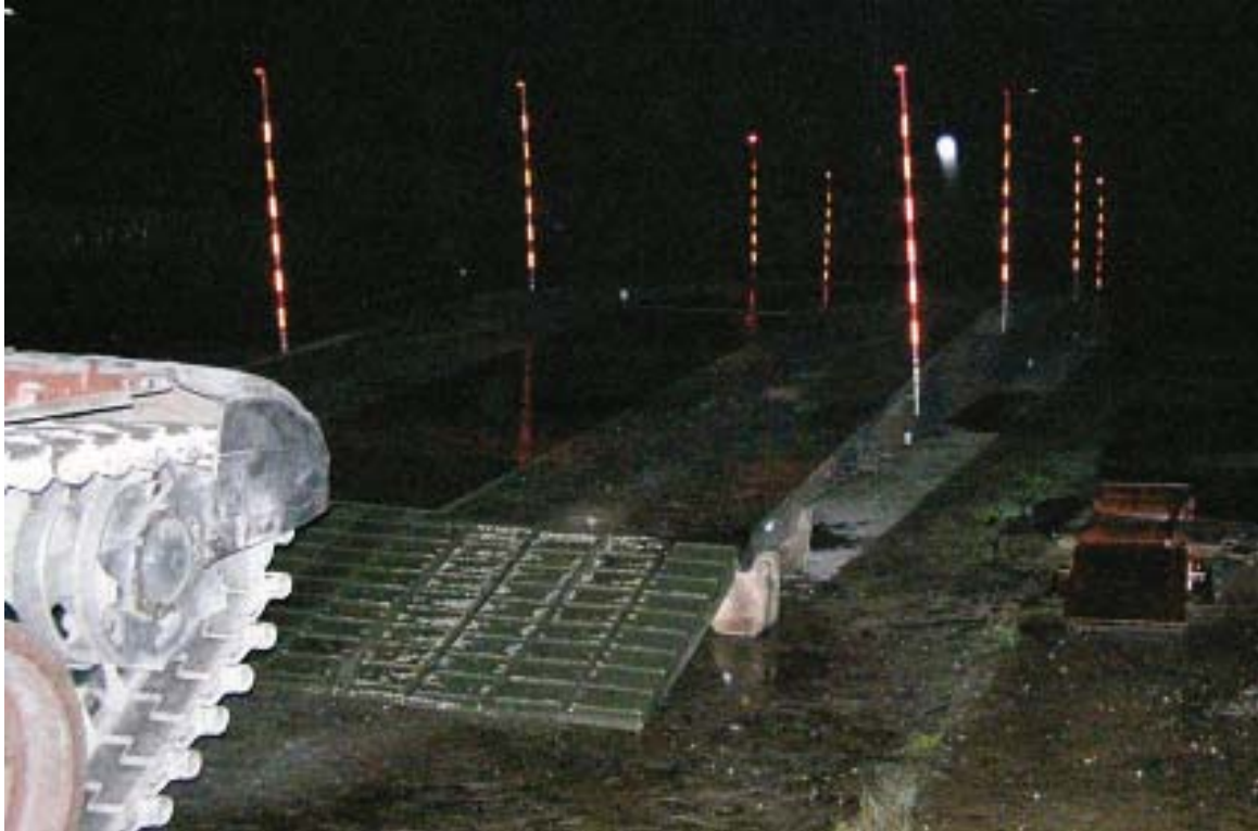
Fig. 9. Span at night