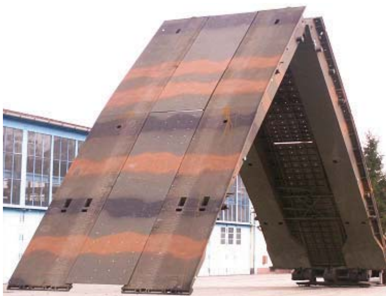
Fig. 8. Span during unfolding