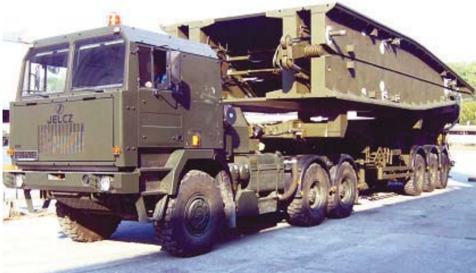
Fig. 1. MS20 bridge set

In theory, only one operator is sufficient to unfold the bridge. Optimum number of operating personnel – 3 men.