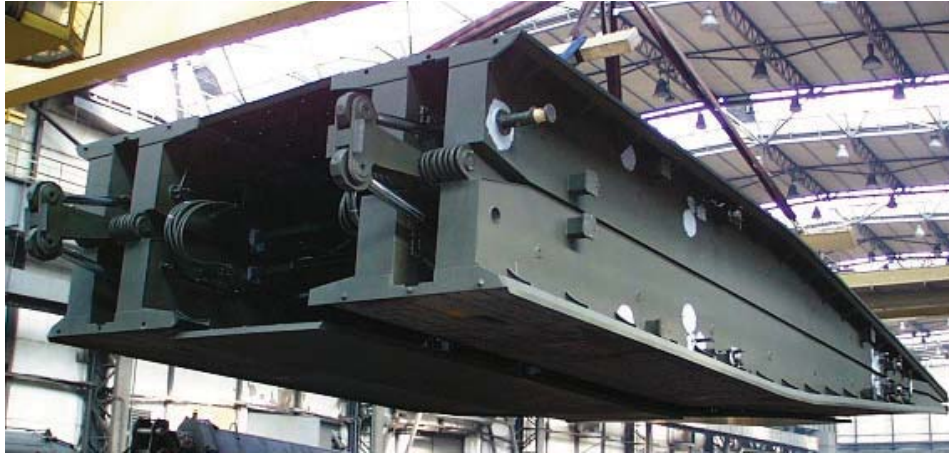
Fig. 5. Folded span