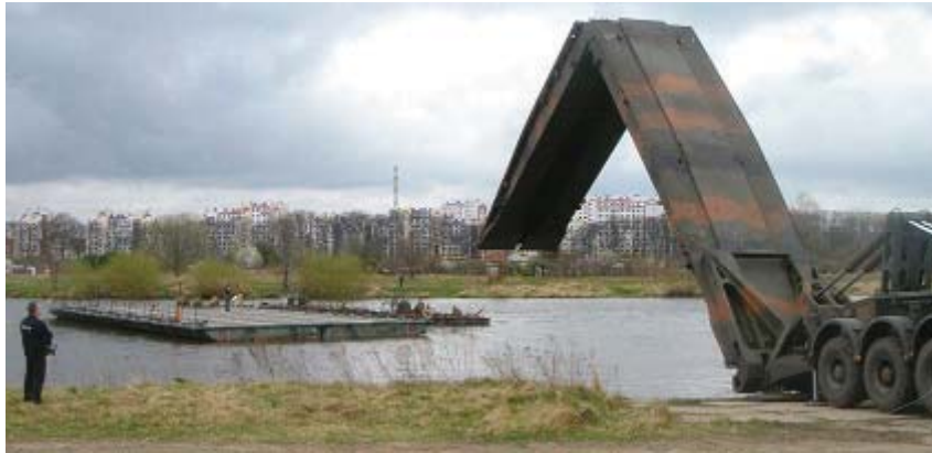
Fig. 16. Test of positioning the span on a pontoon

The bridge set successfully passed wide range of tests according to the Qualification Tests Program. One of the most important elements of these examinations was terrain tests.