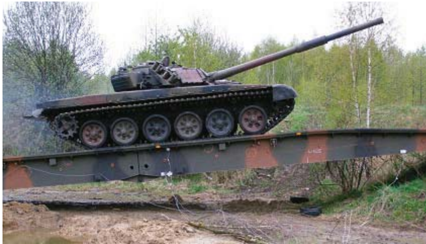
Fig. 17. Tank passing dry pit