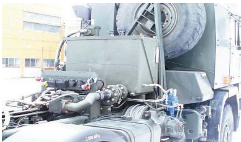
Fig. 4. Jelcz C662D43 truck-tractor – rear view