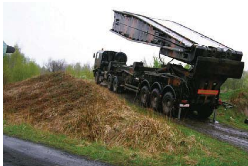
Fig. 18. Unfolding the bridge at inclination 20%