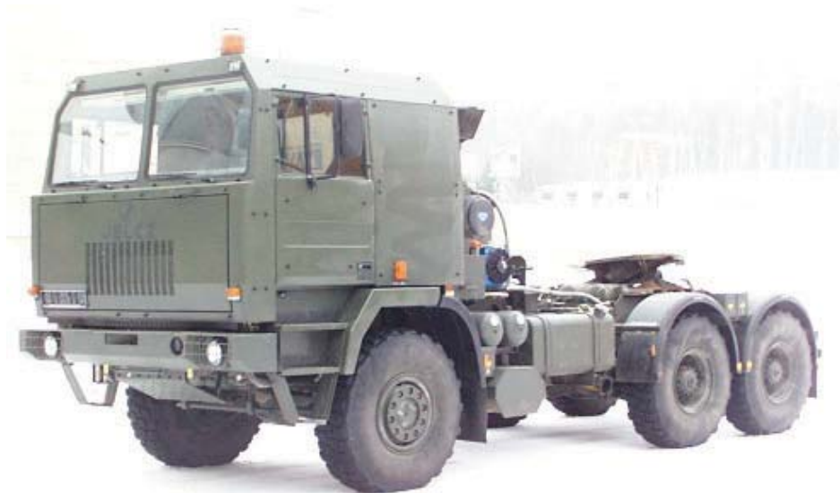
Fig. 3. Jelcz C662D43 truck-tractor

The truck-tractor frame is equipped with catches for coupling the truck-tractor with semitrailer during handling the span. Height of the fifth wheel coupling (1600 mm) as well as diameter of the pin (2") is typical and enable using the truck-tractor for transportation of other semitrailers, not only the special bridge semitrailer.