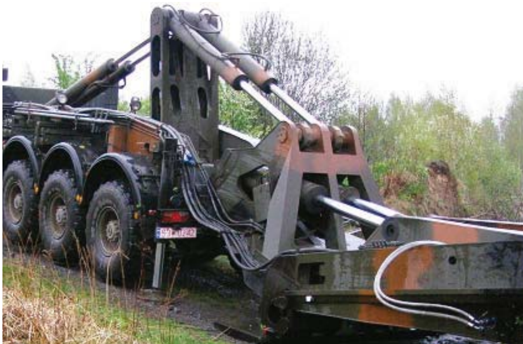
Fig. 10. Layer in unfolded position