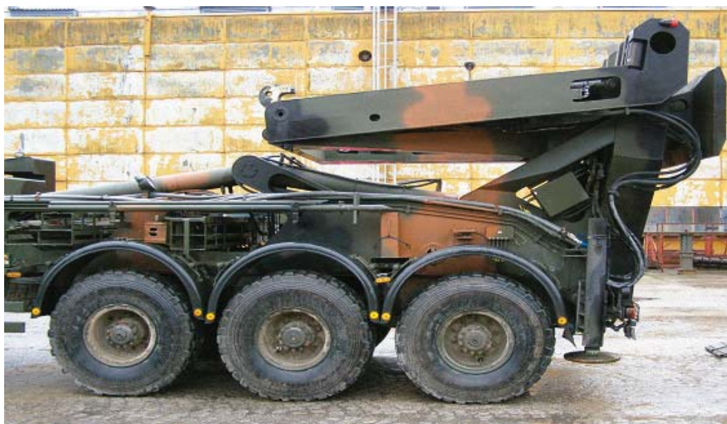
Fig. 11. View of the layer in folded position