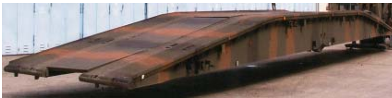
Fig. 6. Span in the final stage of unfolding