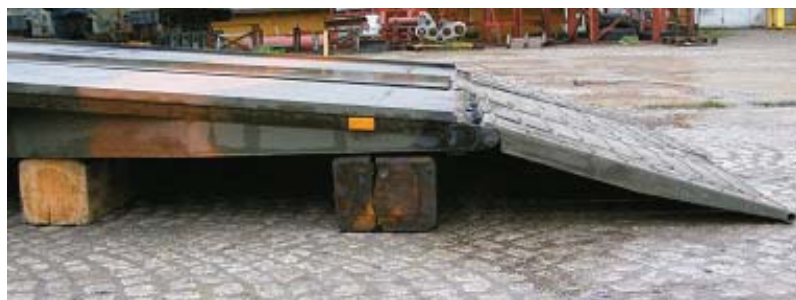
Fig. 7. Part of the span with approach ramps