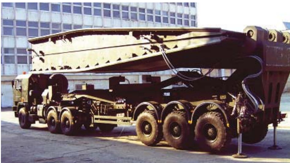
Fig. 2. MS20 bridge set in the beginning stage of unfolding