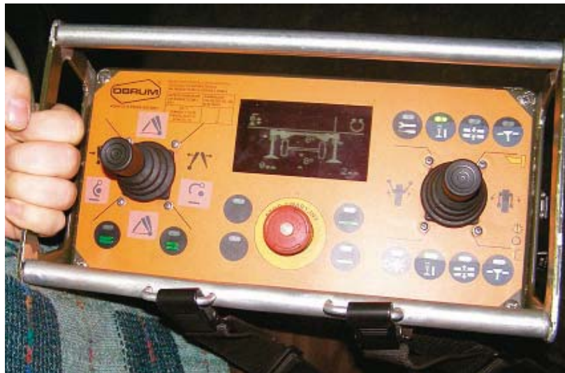
Fig. 15. Portable panel

The control system enables operating the set in automatic and manual mode, controls levelling the system as well as other elements that influence safety, such as hooks coupling, pressure, position of executive elements. Operations are performed by one operator standing next to the set. The operator is equipped with portable panel connected with the semitrailer with a cable. Using the panel, the operator can perform and supervise all activities from levelling to unfolding the bridge, disengaging the hooks and folding the layer.