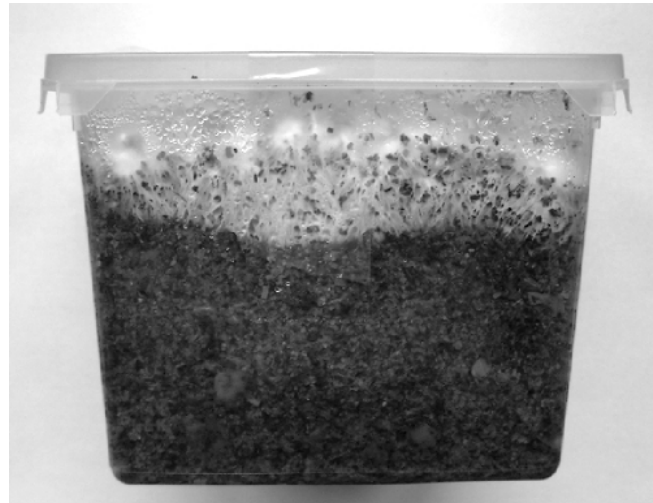
Fig. 2. Mycelium development, 7 days after the inoculation.

and then used for preparation of inoculum (that is prepared in a similar way as spawn for the mushroom culture).