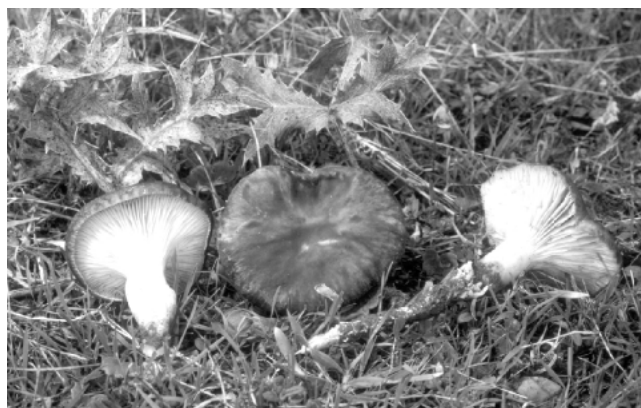
Fig. 1. Pleurotus eryngii degrading the rhizome of Eryngium campestre .

It seems adequate to use easily accessible agricultural or industrial subproducts that are inexpensive, colonized very fast (an elevated biological efficiency) and equilibrated nutritionally, which contributes to the organoleptic conditions (flavour and taste), appropriate for the mushrooms. Moreover, one has to know the adequate relation inoculum/unit of substrate of expansion, which is sterilized or pas-