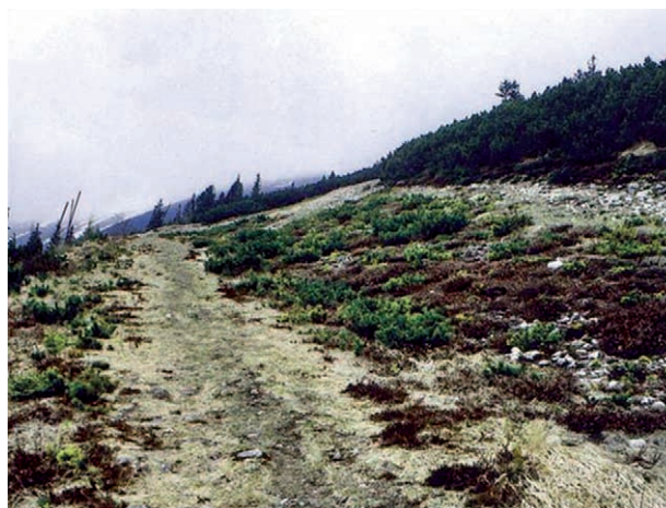
Fig. 2. Example from trace Skalnaté pleso – Tatranská Lomnica