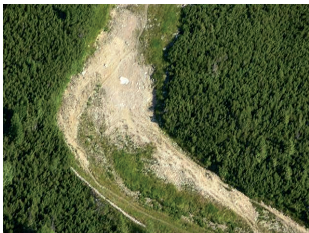
Fig. 1. Area boundary of downhill course and land-cover

IT appears from substructure of land-cover analyse that the proportion of abundance of uncovered substrate (Table 3) is similar to the relationship of those components of Hrebienok downhill course. Abounded discontinuous and diffusive vegetation cover is significant (at average 77%), which is not a suitably adequate vegetation form in the examined vegetation altitude levels, neither for its texture