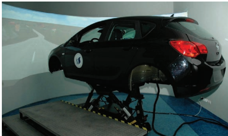
Fig. 2 The research Simulator AS 1200-6

In the AS 1200-6 simulator the simulator motion system is built as a platform (where is installed the cab of the driver) consisting of six electric motors in the system called “hexapod”