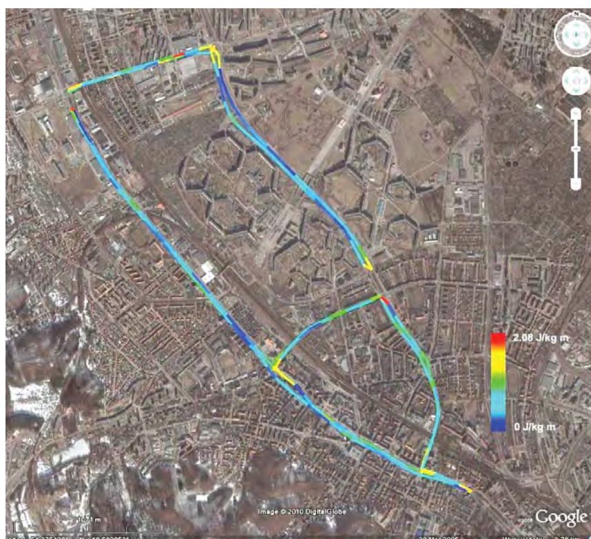
Fig. 2. Map of operating conditions - the specific energy consumption ( \bar{\Phi} )

Gdansk) have been tested. Studies, because of the need to reduce costs, have been made in the 9 01 -12 00 hours (short travel time) on weekdays, but each test was repeated 6 times. Results presented below relate to data averaged for the 7 trials for each segment explored. Graphical representation of multidimensional characteristics (10) will be the geographical map of the area with marked tested road sections, to which vector values of \mathbf{Y}_M (9) were assigned after the road test. The present work contains an example of such a graphical representation of one parameter of vector \mathbf{Y}_M (9) performed with the use of original software that uses the geographical maps available in the application "Google Earth" (Fig. 2). The scale of values and corresponding colours were added to the graph in the form of colours bar.