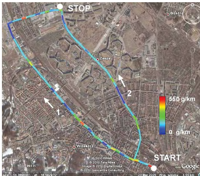
Fig. 3. CO 2 emissions on the routes: 1N i 2N

A more detailed analysis of the results enables its graphic form, which was reproduced in Fig. 3.