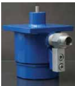
Fig. 8. The angular position sensor CK-1 Rys. 8. Czujnik kąta CK-1

The angular position sensor CK-1, shown in fig. 8, allows converting of the swing arm angle relative to the combine into a digital value. By using two sensors working with the X-axis and Y-axis, the roadheader cutting head can be properly guided while performing the gap. The sensors are mounted on the turntable of a combine.