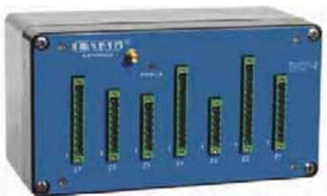
Fig. 4. Communication and processing block BKP-i

The device is equipped with a powerful microcontroller, memory chips and integrated I/O to ensure cooperation between other devices included in the combine control and diagnostics system.