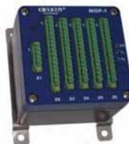
Fig. 5. Buttons module MOP-1

Buttons module MOP-1 (fig. 5) allows controlling the mining combine using switches and keyboard located in desktop on the machine. Additionally, it can control outputs (LEDs, lights control). The device transmits data using CAN or optional RS-485 interface.