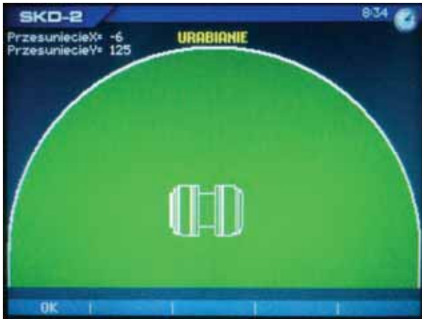
Fig. 1. Display screen – MINING