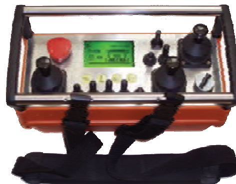
Fig. 6. Remote-control panel of RSO-CH type

Remote-control panel RSO-CH, shown in fig. 6, is designed to radio control the mining combines. The device communicates wirelessly with the panel PAK-1 in the 2.4 GHz frequency band. The panel is equipped with three manipulators, which enable driving and moving the organ, and 8 switches with programmable functions. RSO-CH has an LCD screen, which displays parameters, condition of the machine, information and alarm.