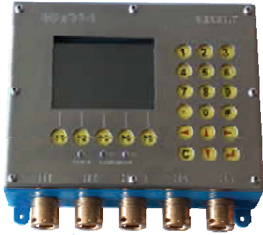
Fig. 7. Intrinsically safe display module MLCD-1 Rys. 7. Iskrobezpieczny Moduł Wyświetlacza MLCD-1