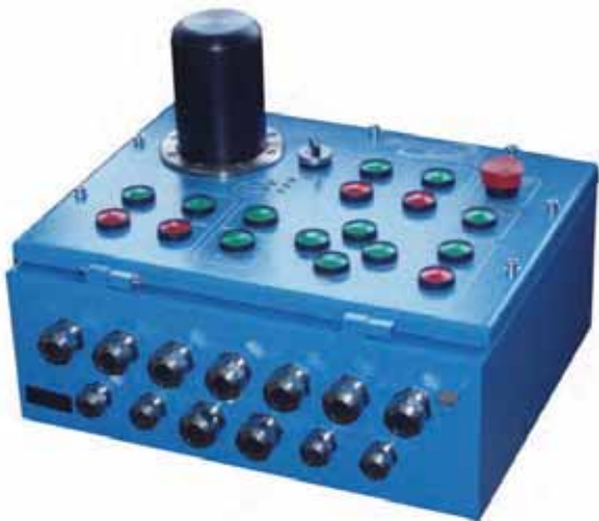
Fig. 3. Operator's panel PAK-1

The operator's panel PAK-1, shown in fig. 3, acts as a central controller of the roadheader, whose main task is to directly control the operation of the machine. Software modules support the following panel control buttons: drive the cutting head, dust collector, sprinkling, hydraulics, feeder, conveyor and driving. The panel controls indications of the system bus and the Bluetooth wireless connection. The device indicates malfunction by the audio signal.