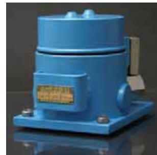
Fig. 9. The levelling sensor CN-1 Rys. 9. Czujnik niwelacji CN-1

The levelling sensor CN-1 (fig. 9) is an electronic inclinometer. It determines the angle of combine deflection from the level, determined based on direction of the strength of Earth's gravity, and enables driving the machine by levelling point. Similar as in case of the angle sensor CK-1, data are presented in the form of an animated graphics on the MLCD-1 screen. The event of exceeding the pre-set value of levelling angle is indicated by a relevant message.