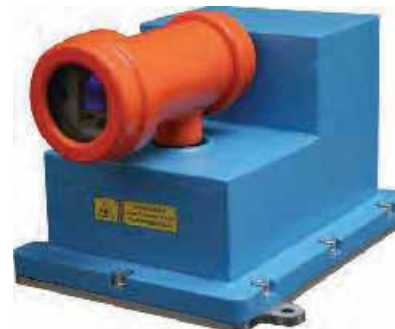
Fig. 10. Combine position sensor CPK-2 Rys. 10. Czujnik położenia kombajnu CPK-2

The combine position sensor CPK-2, shown in fig. 10, is the most important part of the system. It supports the operator's work by setting the combine position with respect to the side wall. The sensor contains a control system, a drive system and a laser rangefinder mounted on a turntable of the combine. The microprocessor determines the position of the machine axes relative to the excavation axis. This ensures accurate tunnelling in correct direction.