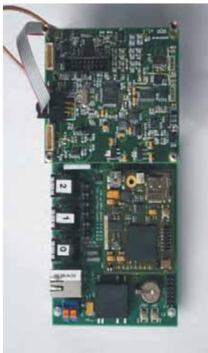
Fig. 9. Micro Computer AXMOD with A/D converter

characteristic for the terrain over which the flight is realised.