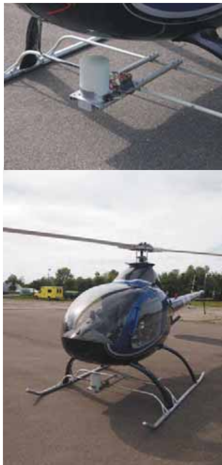
Fig. 10. Installation of anti-collision system on A600 "Talon" helicopter

checking of assumed parameters. Improvements introduced in algorithms of data processing are expected to improve robustness to disturbances and efficiency of obstacle detection.