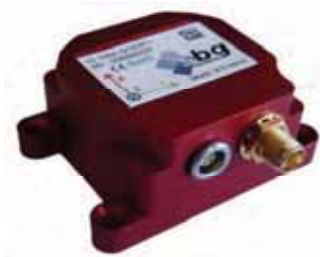
Fig. 6. The reference system AHRS of IG-500N type Rys. 6. System odniesienia AHRA typu IG-500N

The AHRS and CRW are additional measuring modules assuring the correct operation of the system. The Attitude and Heading Reference System (AHRS) of type IG-500N (fig. 6), tendered by the SBG Systems company [2], is capable to estimate in wide range the attitude and linear position of the object flying in airspace. The device also delivers three components of linear velocity, angular rate, as well as components of acceleration. The maximum frequency of sampling used in AHRS is 100 Hz. The imbedded GPS receiver is used to compute the estimate of position in geographical coordinates (WGS84 standard) with 4 Hz frequency [3] and the absolute height (altitude) corrected by pressure sensors. Information, obtained from the AHRS, on attitude, position, and linear velocity of flying object is used to compute the estimates of absolute position and velocity of detected obstacle.