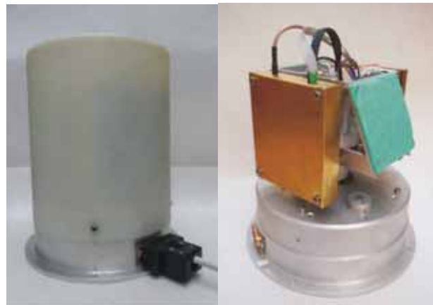
Fig. 4. Radar obstacle detector with cover Rys. 4. Radarowy detektor przeszkód w obudowie

two IVS-148 type transmitters/receivers, 24 GHz modules, each one installed with transmitting and receiving antennas on one board of electronic hardware. Both modules are fastened to the upper side of stiff rotating platform at opposite sides (fig. 3). The signal is received from first and second modules interchangeably and then processed successively in modulator, washout filter and amplifier.