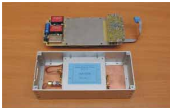
Fig. 8. Elements of Digital Radio Altimeter Rys. 8. Elementy Cyfrowego Radio-Wysokościomierza

The digital radio-altimeter (figs. 7, 8), designed and manufactured in the Institute of Aviation is capable to measure the flight height over the surface of the Earth within the range from 0 m up to 300 m with 20 Hz frequency. The obtained accuracy is \pm 1 m within the range from 0 m up to 20 m and not worse than about \pm 5\% over this range. The vertical velocity is estimated within the range \pm 1 m/s up to \pm 30 m/s. CRW, when compared with the AHRS, is a more trustworthy source of information about the relative flight height. This is the reason that the role of CRW is, in case of the possibility to use a data base of terrain height. The correlation of the relative flight height and tendencies of its variation can make it capable to forecast the threat of the crash of the flying object into the ground.