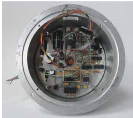
Fig. 5. Radar obstacle detector – view of the bottom Rys. 5. Radarowy detektor przeszkód – widok od spodu

Numerical processing of signal is realised in AXMOD-RDP computer. The Fast Fourier Transform (FFT) is computed there. Then, the obtained spectrum of the signal is analysed to decide the existence (detect) of hypothetical obstacles within the considered sector. When the obstacle is detected, two characteristic, crucial parameters are determined: the range between the obstacle and the object and the radial velocity of the obstacle towards the object. The RDP is capable to detect up to five obstacles in one sector with aforementioned parameters. Detection is accomplished in horizontal plane within the forefront of half-sphere, in the section defined by the angle of 156°.