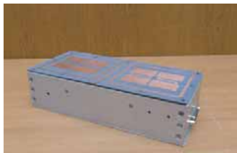
Fig. 7. Digital Radio Altimeter (CRW) Rys. 7. Cyfrowy Radio – Wysokościomierz (CRW)

Taking as example measuring of constant attitude angles, the accuracy is not worse than \pm 1^\circ . Obtained accuracy of measurements makes it possible to classify this system as one in medium class of similar devices. Small dimensions, 36 \times 49 \times 22 mm, and small mass, 46 g (without GPS antenna), define the advantage of discussed device.