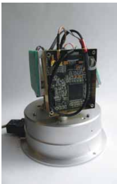
Fig. 3. Radar obstacle detector (RDP) Rys. 3. Radarowy detektor przeszkód (RDP)

The Radar Obstacle Detector is the basic device delivering the information about the current situation within an airspace area surrounding a flying object. It consists of