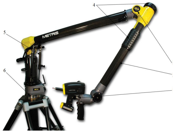
Fig. 1. Coordinate measuring arm.

Studies were performed using a Metris Nikon Metrology Series MCA II [7] coordinate measuring arm which is in the equipment of the laboratory of the Institute of Metrology and Biomedical Engineering of Warsaw University of Technology (Fig. 1). This is a seven-axis portable measuring device designed to work in the environment of production, in laboratories. Because of applying a rechargeable battery and wireless communication it can also be used outdoors.