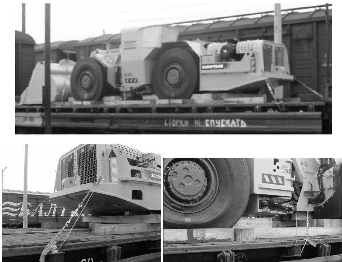
Fig. 1. Location and fixation of wheel vehicles on the wagon by flexible, thrust and supporting elements jointly with screw connection with right-hand and left-hand thread

In West-European countries and in America cargo is also fastened to the open rolling (wagons and motor transport) together with flexible (straps, cables, forged chains), thrust (thrust bars) and supporting (pads) fastening means (Fig.1) [3-5]. A distinguishing feature of these fastening means as compared to the Russian ones is the fact that fastening elements are the cables fixed to cargo and to a wagon frame by means of screw connection with right-hand and left-hand thread, Modulus of elasticity of these cables just as that of ordinary steel is equal to E = 2,1 \cdot 10^8 kN/m 2 (whereas modulus of elasticity of annealed fastening wires E is 20 times as little as ordinary steel, i.e. E = 1 \cdot 10^7 kN/m 2 ).