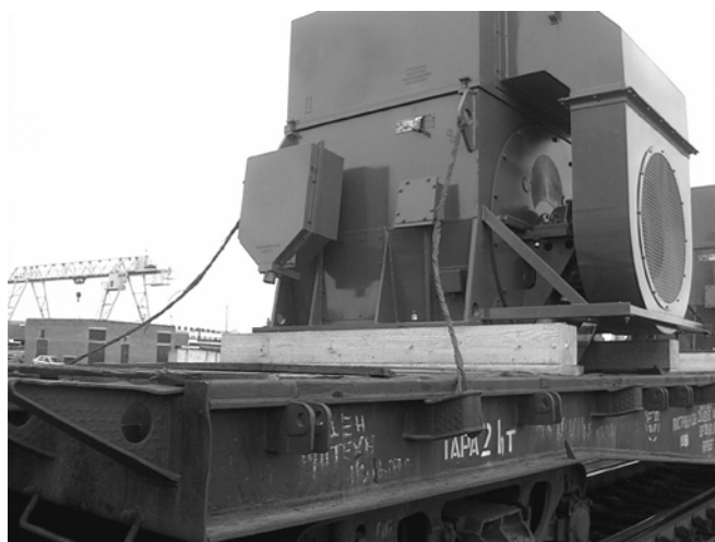
Fig. 2. Real model of cargo location and fastening in the wagon by means of flexible, thrust and supporting elements

Рис. 2. Реальная модель размещения и крепления груза на вагоне гибкими, упорными и опорными элементами