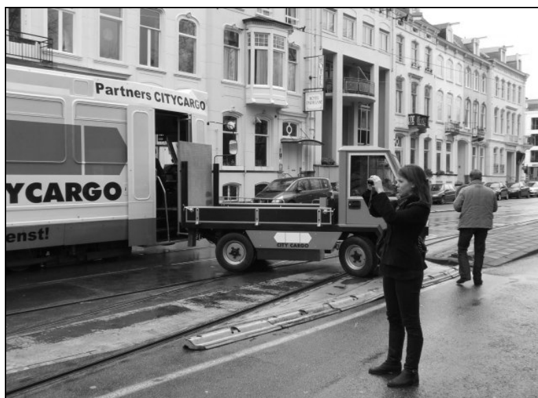
Fig. 1. CityCargo Tram in Amsterdam

The operation pattern of CityCargo was: The freight to be transported was received in warehouses on the outskirts of Amsterdam, where freight was shipped in CityCargo trams. CityCargo trams took freight to locations inside Amsterdam. They were using alternative routes on the existing tram network of Amsterdam. , The routes of CityCargo trams were not explicitly fixed. Instead, the routes were specified according to demands, congestions, peaks and off-peaks. By using different routes, the CityCargo trams did not intervene with the passenger tram services. After arriving at the desired location deep inside the city of Amsterdam, the freight from the CityCargo trams was moved to “Green” Vehicles (also called E-Cars, see Fig. 1 [15]). These Green Vehicles then transported the freight to the final customer.