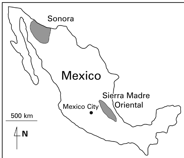
Fig. 1. Distribution of marine Lower Jurassic outcrops in Mexico (Sonora and Sierra Madre Oriental).