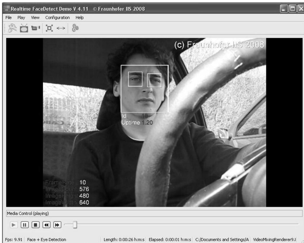
Fig. 3. An example of face and eye region detection using an application from the institute: Fraunhofer -Institut für Integrierte Schaltungen

Rys. 3. Przykład detekcji obszaru twarzy i oczu za pomocą oprogramowania instytutu: Fraunhofer -Institut für Integrierte Schaltungen