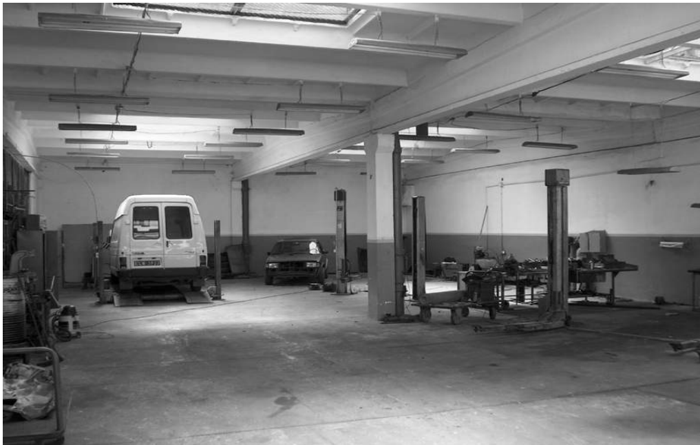
Fig. 4. Work centre dismantling method [9]

Dismantling work centre method - in that method a group of workers dismantle parts and assemblies for regeneration, further use or for recycling (fig. 4). Each type of car assembly is separated and segregated and put to individual container and then it is transported to warehouse or recycling station. Each stand is equipped with car lift with pneumatic tools for disassembly. Further disassembly is made on work benches.