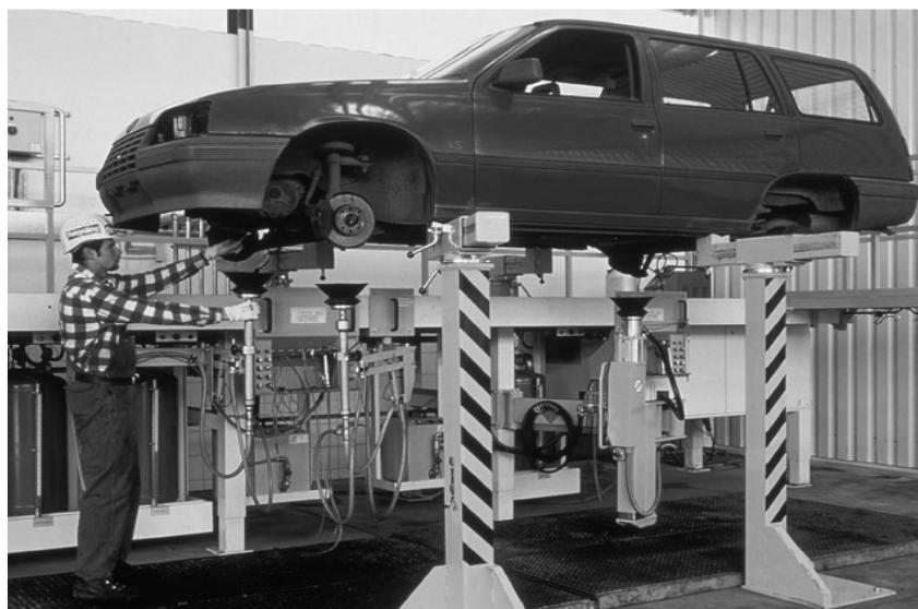
Fig. 3. Drainage of fluids from the vehicle [9]