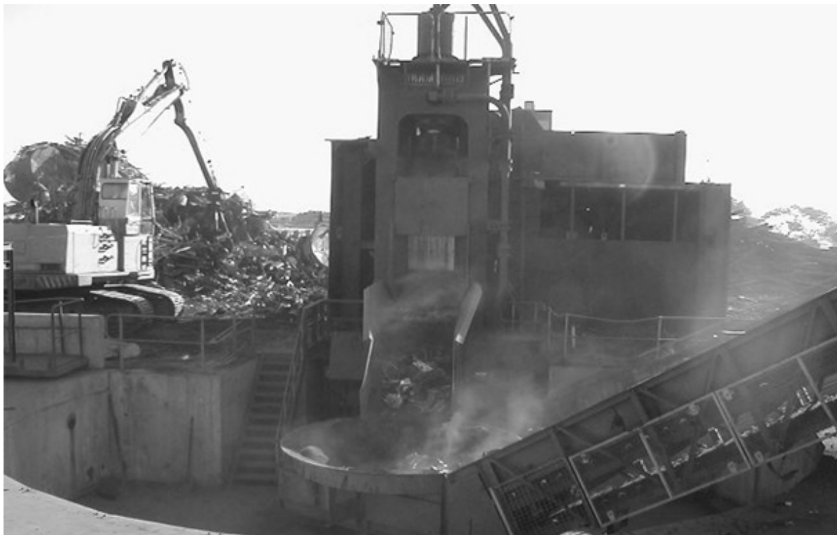
Fig. 5. Metal shredder [10]

The most profitable is regeneration of parts and selling of engine subassemblies (or even entire engines), body and chassis assemblies. All parts that could be used again after refurbishing can be sold directly to other users. All remaining like: chassis or body is kept on storage yards on special racks. Then they are transported to shredders (fig. 5). Typically shredding of one vehicle (with average mass 600 kg) takes 20 seconds. Then different segregation methods are used for selecting material by different physical properties. It is made in pneumatic and magnetic segregation. Some of remainings can be recycled as fuel in cement plants or ironworks.