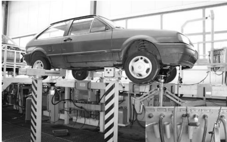
Fig. 2. Industrial line method of vehicle dismantling [9]

The industrial line method is similar to production line. The capacity is high and it is analogical to production in the reverse direction (fig. 2). This process requires fluency of dismantling and high productivity.