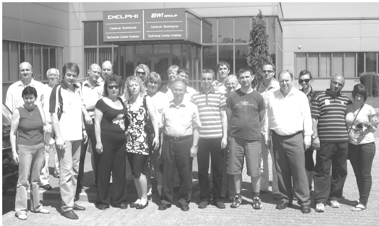
Fig. 8. Conference participants during visiting Delphi Poland S.A. Рис. 8. Участники конференции во время посещения фирмы DELPHI