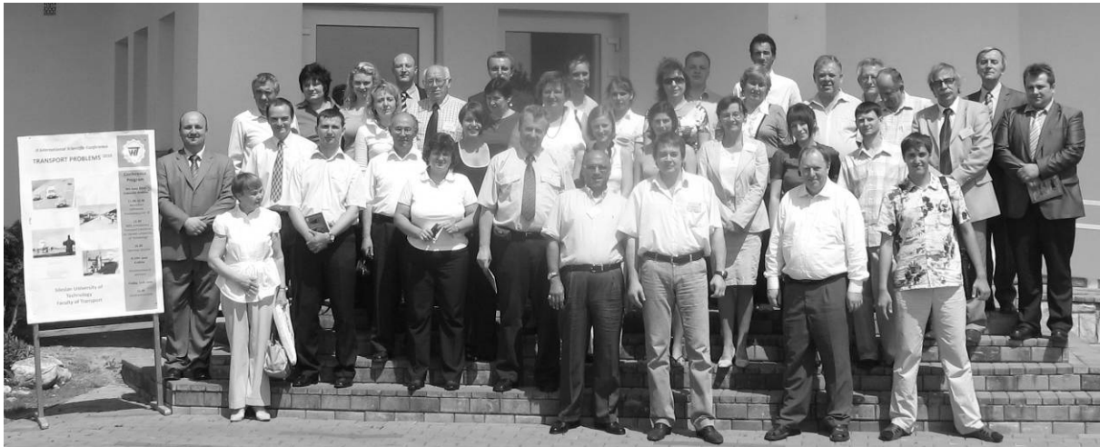
Fig. 7. Conference participants after session of one of sections in Krakow Рис. 7. Участники конференции после заседания секции в Кракове