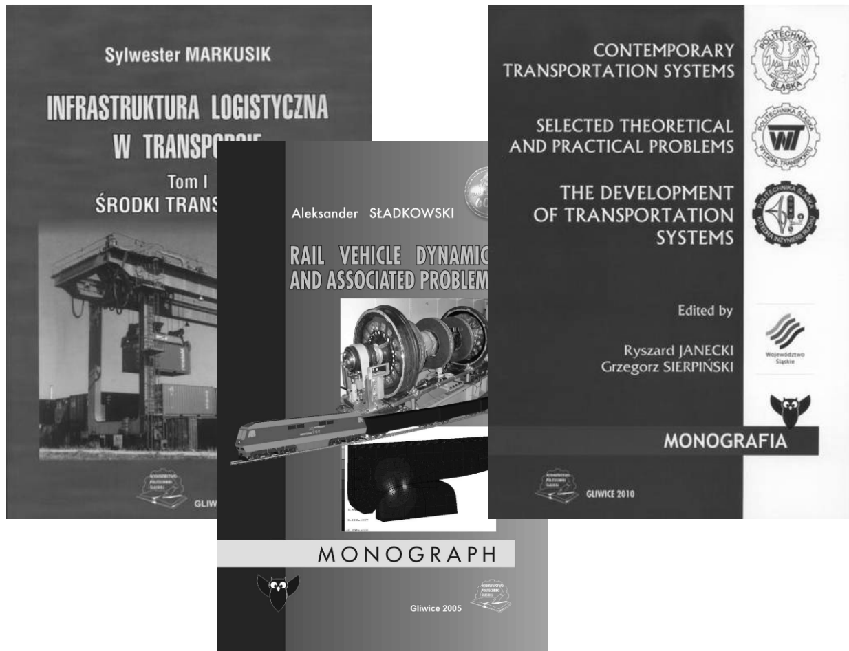
Fig. 1. Some books of employees of the Faculty of Transport published in publishing house of Silesian University of Technology

Its edition has proceeded and on fig. 2b the example of the given collection which has been published in 2007 is shown.