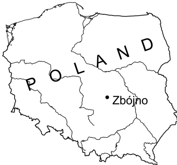
Fig. 1. Location of the Zbójno site in Poland.