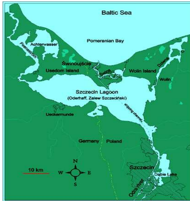
Map 2. Location of the port of Świnoujście.

On a map No 3 shows the distribution channels and wharfs of the port of Świnoujście.