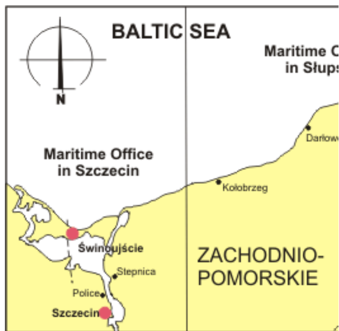
Map 1. Location of the port of Świnoujście.

At the entrance to the port at the West breakwater, It is Western [5, 6, 16, 17, 33, 39, 40]. During the winter, the port is usually free of ice. Freezing docks and only after long periods of freezing weather occurs rarely [5, 6, 16, 17, 33, 39, 40]. On a map No 1 and 2 shows the location of the port of Świnoujście.