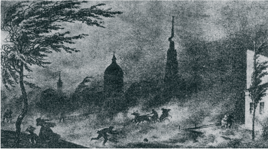
Fig. 3. Difficult natural conditions.

“The Plan of Khadjibey city”, developed in January-February, 1794 by Francois Devolan, is considered to be the high achievement of domestic town-planning culture of the Classicism period. In this plan the topography of the area is successfully used, the climate conditions and the military-defending structure of the city are taken into account, and the expressive planning decision is shown. The port was placed on a low coastal part. The inhabited zone is decided on an upper plateau with the large territorial reserve. Relating to the composition, the inhabited zone is represented by two grids of blocks located under a 45° angle to each other. The trace of cardinis and decumanus streets of an antique lay-out is coordinated to Military and Quarantine ditches used as descents from the city to port (connection with the sea). The lay-out of the city is solved in complete conformity both with antique tradition and with the conditions of the area.