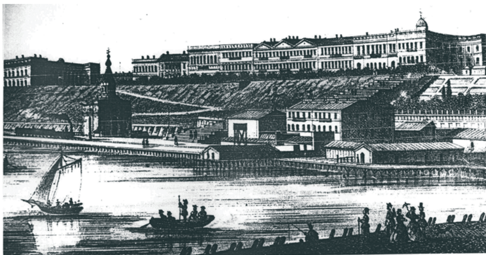
Fig. 2. View from the sea.