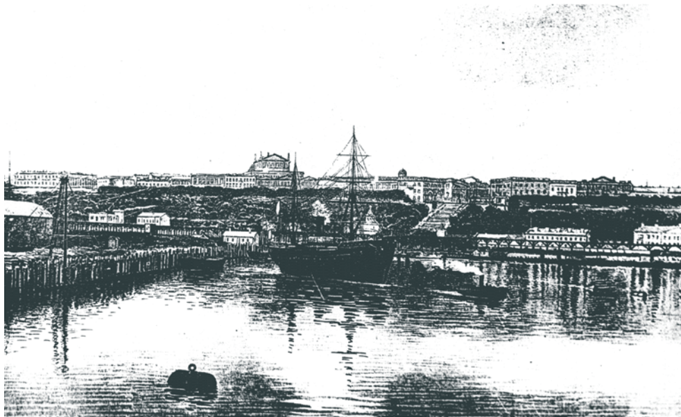
Морський фасад Одеси

terrible heat in the summer and the terrible blizzards in the winter, stony, sandy ground, absence of sources of fresh water,- not only huge energy and invincible persistence are needed, but also laborious work and thorough all-round knowledge of the business” (Fig. 3) [2].