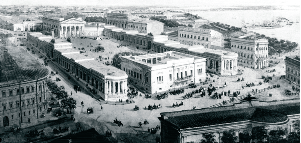
Fig. 6. Project of the Theatrical square G. Torichelli.