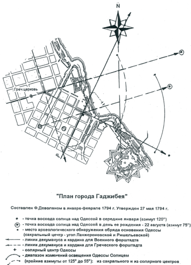
Fig. 4. Odessa - city of the Sun.

The first correct planting of the trees was provided by Felix De Ribas. He had carried out the dream of his brother - founder of Odessa - Admiral Joseph De Ribas, who favoured a summer residence 5 kilometers away from Odessa. The first trees in Odessa were planted by the brothers on an empty site of the city, in so-called Greek quarter. Count Felix Pototsky sent species for this garden from his famous Sofia park. The large garden (more than 2 hectares) in 1806 was gifted to the city and bears the name of City Garden.