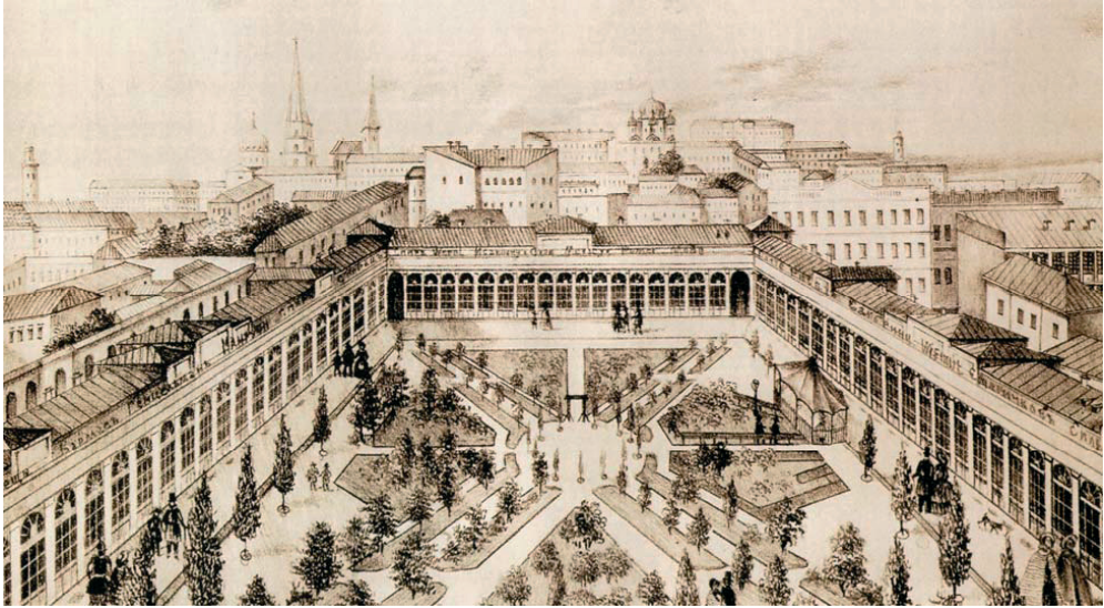
Fig. 8. Ensemble Pale Royal.

The accomplishment of City and Dukovsky gardens, establishment of Pale-Royal square testifies to the special attention paid to green plantings of public usage (Fig. 8). The descents to the sea on the Big and Middle Fountains also were planted. Under gardens and vineyards in 1846 in Odessa were registered 10512 hectares [2].