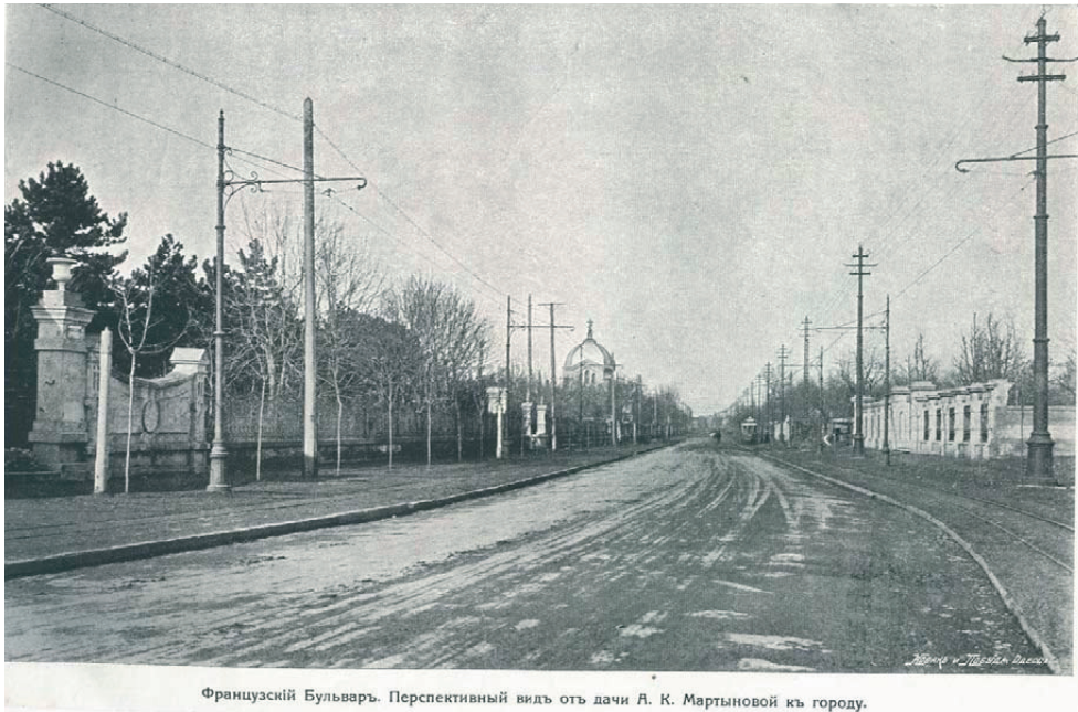
Fig. 9. Malofontanskaya road - Boulevard de France.

The volumes of assignments on their contents testify to fast development of urban gardens, so if in 1884- 11600 roubles were allocated, in 1894 – already 28.359 roubles (100). In 1884 the Odessa department of an Imperial Russian society of gardening was open. It took active measures on improvement of this branch. In 1886 the initial school of gardening and kitchen-gardening for preparation of the experts was founded, because the urgent need in them was felt. Every summer at this school the free-of-charge monthly classes of gardening and kitchen gardening for folk teachers were open.