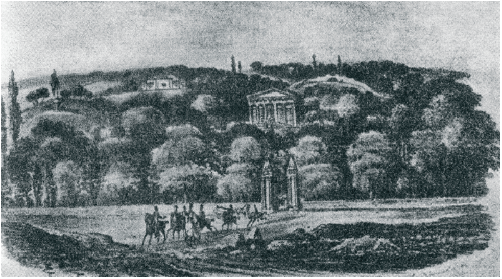
Fig. 5. Dukovskiy garden. Dacha of Rishell'e.