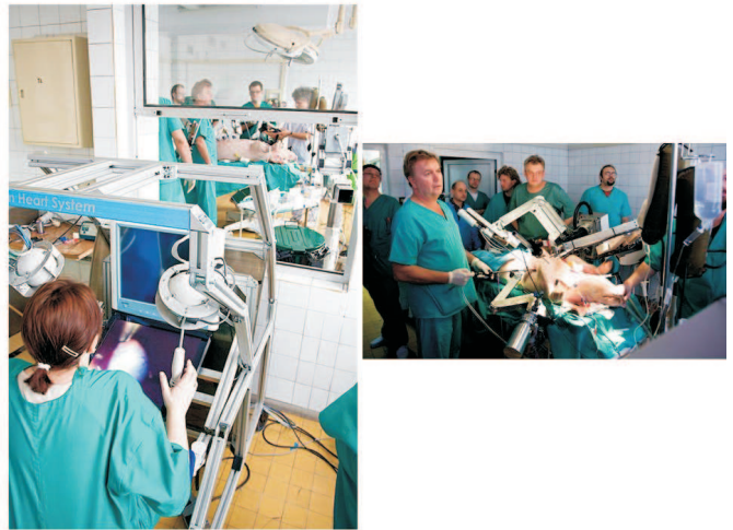
Fig. 3. The animal experiment

Heart Shell console. The opportunities of operating by means of the Robin Heart Uni System mechatronic tool are very promising, as it may be mounted on the robot's arm or controlled manually.