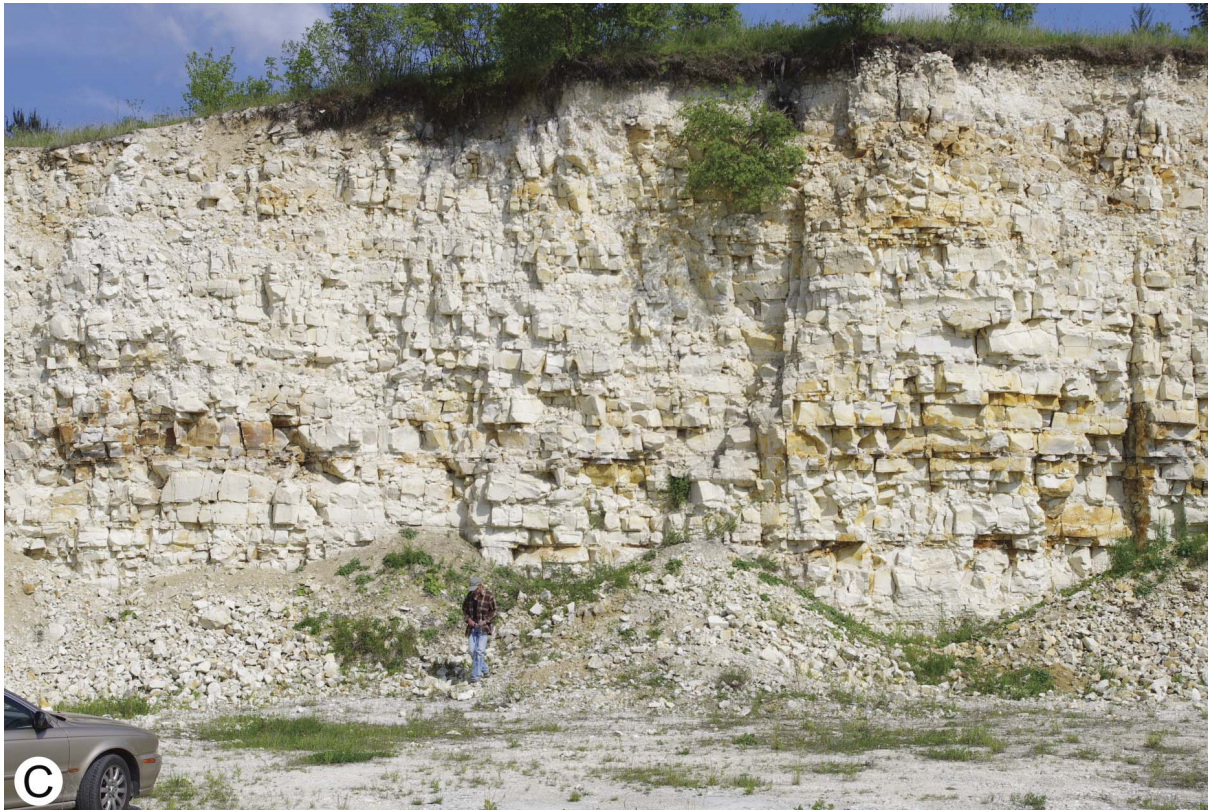
Text-fig. 2b. Photographic view of selected sections studied; C – Dziurków section, view from the west