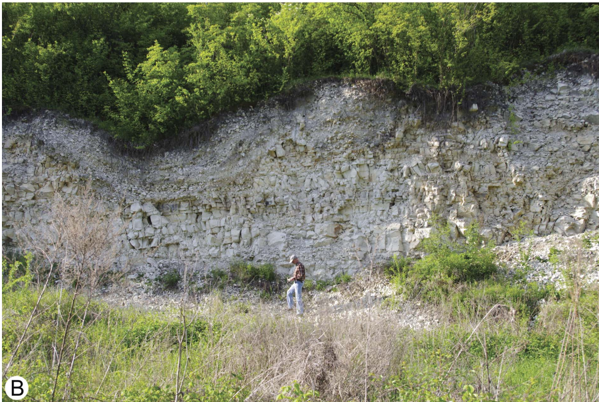
Text-fig. 2a. Photographic view of selected sections studied; A – Raj North section; view from the north; B – Raj section; view from the south