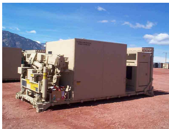
Fig. 1. Forward Repair System workplace of US Army