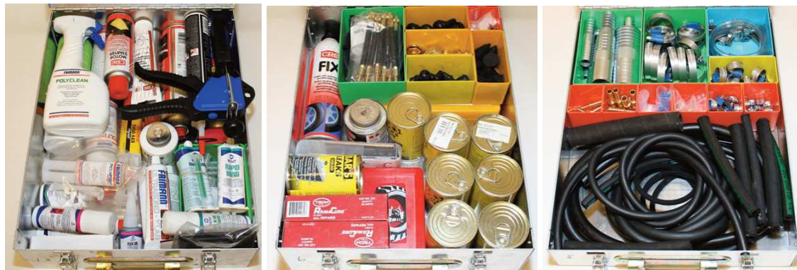
Fig. 7. Examples of repair kits used in Norwegian Army

In the mobile container workplace we also suggest putting the sets of battle damage repairs kits such as: metallurgical material, connection accessories, electrodes for electric arc welding, welding material for flame welding, soldering process, adhesives materials and materials used for repairing tire tubes and tires. The selection of demanded repair kits can be conducted on the basis of the other armies of NATO experiences (Fig. 7). Beyond that we suggest choosing selected, according to statistical data, spare parts which should be available since they are frequently used during the maintenance of land combat vehicles in field conditions.