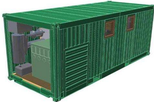
Fig. 3. Workplace module profile