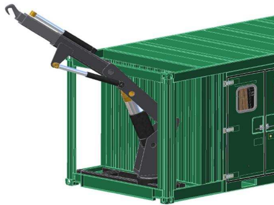
Fig. 6. Hydraulic crane in an operating position