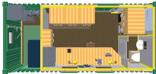
Fig. 4. Top view of workplace module

The non-sealed part of a workplace module include following devices: the filter and ventilation plant FVZ 98, the power source of a minimum power capacity 15 kVA, the air conditioning of a power capacity to 5 kW, oil firing (6 kW), 2 pieces of an oil can, a set for lighting the workplace.