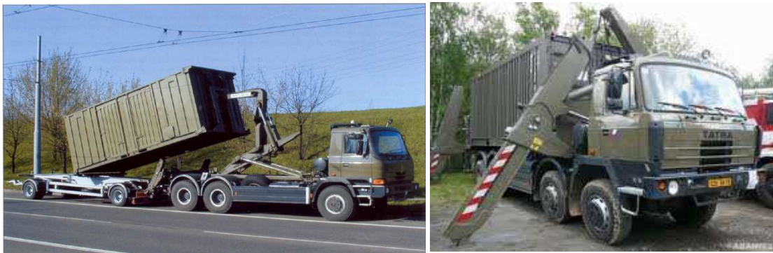
Fig. 8. T-815 – Multilift hook lifter (left) and T-815 KLAUS (right)