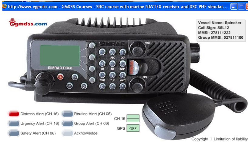
Fig. 3. Interface of VHF simulator

knowledge of the GMDSS. While others procedures used in marine communications and discuss marine radio equipment required in the area A2, their service and supplies. Each chapter contains test that allows you to check the degree of assimilation of the material in question. For course participants four online simulators were prepared, respectively, MF/HF DSC [2] (fig. 2), VHF DSC [5] (fig. 3), Navtex and Inmarsat C.