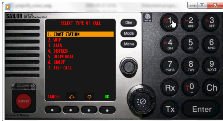
Fig. 1. Interface of MF/HF simulator ( www.egmdss.com )

Simulators are getting old sooner than some would expect. They require the physical presence of students during specified hours. Often the number of seats is limited, as well as time spent in training posts. They are relatively expensive and costly in use (operation). Therefore, these artificial ones are increasingly being replaced by computer applications. Such applications may be replicated or just some of their functions. In addition, there is often a remote possibility of their running and maintenance. In such applications, learners can practice in advance selected tasks. With that approach they can have better understanding of function of real equipment and be able to for directly execution of exercises.