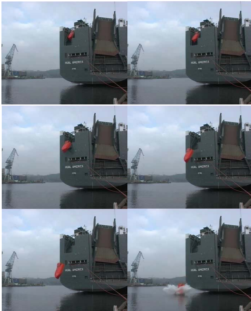
Fig. 1. The free fall lifeboat launch