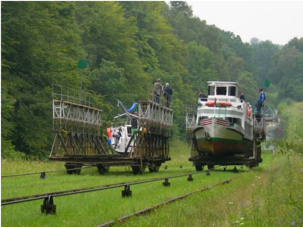
Fig. 2. Ramp in Buczyniec