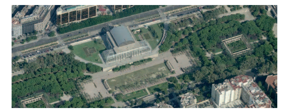
Fig. 28. River Turia Park: Stretches 10 & 11

Ryc. 28. Park nad rzeką Turia: Odcinki 10 i 11