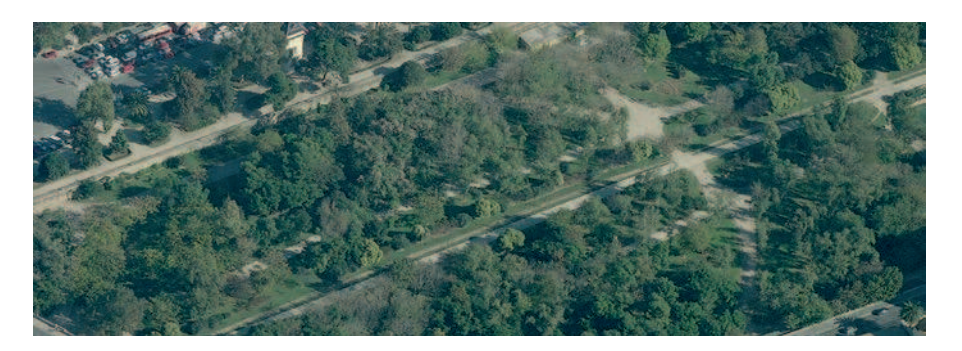
Fig. 25. River Turia Park: Stretch 8

Dimensions and location: A 225 m long and 160 metres wide stretch lateraly limited by vertical stone embankments. On its eastern side is flanked by the Alameda Gardens (see stretch 8) and in the