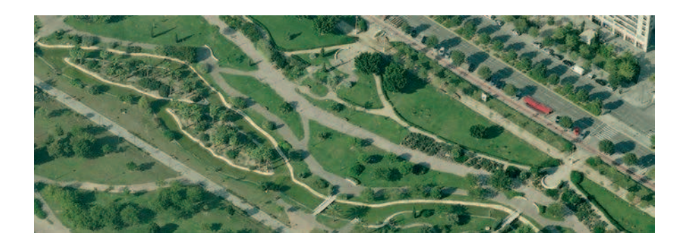
Fig. 31. River Turia Park: Stretches 13 & 14

Ryc. 31. Park nad rzeką Turia: Odcinki 13 i 14