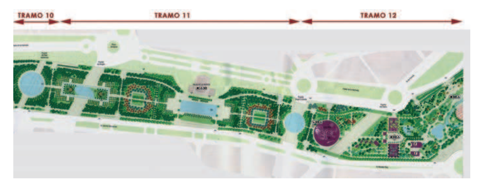
Fig. 27. Stretches nş 10, 11 & 12 of the River Turia Park (from the Valencia's Park's and Garden's Guide, MEDINA PILES, A.,et al, 2010)