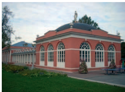
Fig. 4. The garden pavilion in Vorontsovo park