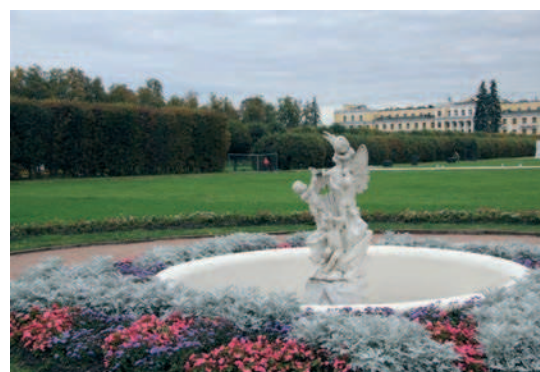
Fig. 2. The fountain in the Arkhangelskoje park Ryc. 2. Fontanna w parku Archangielskoje

Manor of a new type, which was created under the influence of the Enlightenment ideas, represented not only an economic unit but also an aesthetically organized space – it was a palace or a mansion surrounded by a landscape park.