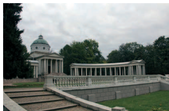
Fig. 1. View of the Arkhangelskoje park Ryc. 1. Ogólny widok parku Archangielskoje

Integracja rodzajów sztuki w tradycyjnych rosyjskich parkach i ogrodach