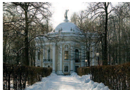
Ryc. 7. Park Kuskowo w zimie