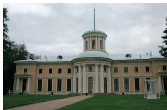
Fig. 4. Main residence in the Arkhangelskoje park Ryc. 4. Rezydencja w parku Archangielskoje