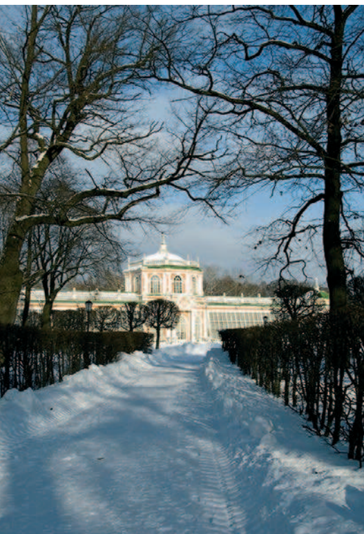
Fig. 5. The avenue in Kuskowo park in winter