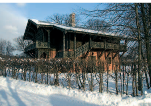
Fig. 6. Swiss pavilion in Kuskowo park