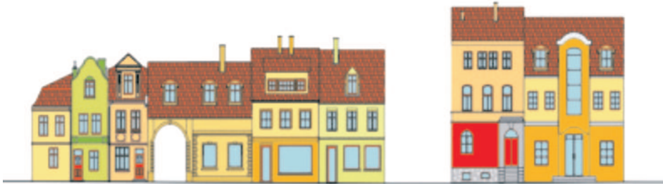
Fig. 6. The buildings along the north frontage of the square – a revalorization concept

In addition to the suggested designs of houses, a new surface of the square and some street furniture have been proposed. By suggesting to pave the surface with small stone blocks and cobbles it is hoped to achieve the benefits attributed to using natural building materials. Besides, some interesting patterns on the paved surface can be created.