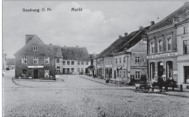
Fig. 4. The pre-war buildings on the Old Town Market Square in Jeziorany

The arrangement of the townhouses with their roof ridges parallel to the streets, the small-scale houses and narrow land plots, the rhythm of doors and windows as well as historicizing details have all superimposed the way in which the new buildings completing gaps between the existing ones have been designed and the ones which disagree with the historic houses have been re-designed. Most of the proposed changes concern the west frontage of the square and new buildings in the north frontage. The designed architectural solutions draw on the historic buildings, and are therefore an attempt at connecting the rows of houses along each side of the market square (Figs 5, 6).