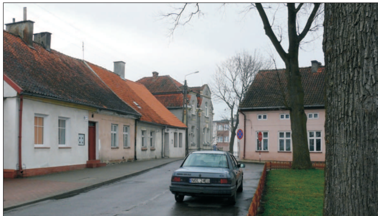
Fig. 9. Castle Square – the north frontage

Moving on from the market place towards Castle Square, we notice a protruding fragment of the row of buildings along the north side of the square. It consists of residential houses, one- or two-storey tall, with gable and pediment roofs, and with partly habitable or completely unused attics (Fig. 9). The revalorization of these buildings should include converting the attics into habitable space, adding more light to the existing interiors, tampering with the facades by changing the colour of the walls, bringing some order to the whole composition and completing the missing architectural ornaments.