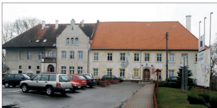
Fig. 11. The Town Council in Jeziorany – the current state

The most prominent building located at Castle Square is the one housing the Town Council. This is a three-storey building with a hipped roof, visually divided into two parts, which occupies the whole west frontage of the square (Fig. 11). In order to emphasize the stately function of the building, a historicizing, columned portico crowned by a tympanum with the town's coat of arms featuring in the middle has been designed. Several other architectural ornaments contribute to the whole design, such as cornices between the storeys and under the roof or door and window trims (Fig. 12).