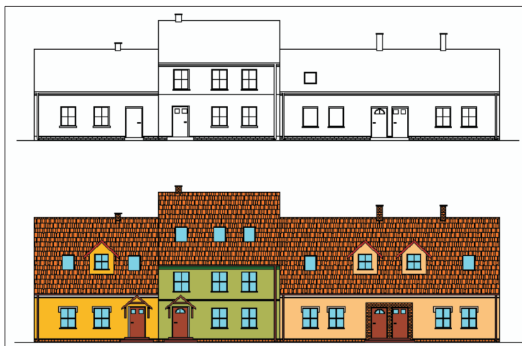
Fig. 10. The north frontage of Castle Square – the current situation and the revalorization concept Author: M. Adamczewski.

The most prominent building located at Castle Square is the one housing the Town Council. This is a three-storey building with a hipped roof, visually divided into two parts, which occupies the whole west frontage of the square (Fig. 11). In order to emphasize the stately function of the building, a historicizing, columned portico crowned by a tympanum with the town's coat of arms featuring in the middle has been designed. Several other architectural ornaments contribute to the whole design, such as cornices between the storeys and under the roof or door and window trims (Fig. 12).