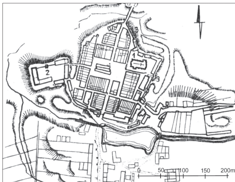
Fig. 1. The street plan of the centre of Jeżiorany in the 1950s 1. St Bartholomew Church, 2 – the castle of the 14 th – 19 th century (today, the Town Council), 3 – fortified walls of the 14 th century

Jeżiorany is a small town in Warmia, lying in the central part of the Province of Warmia and Mazury. It is the capital of the commune of Jeżiorany ( gmina Jeżiorany ). The town was founded in 1310 and granted a charter in 1338. Apart from the well-preserved medieval pattern of the streets, other material remnants of the town's history are St Bartholomew Church in the Gothic style, with an antique pipe organ, the Chapel of the Holy Cross, the 18 th century Baroque Gatehouse, a Lutheran church and fragments of a castle raised by the Bishops of Warmia, such as vaulted cellars, on which the present-day building of the Town Council in Jeżiorany stands.