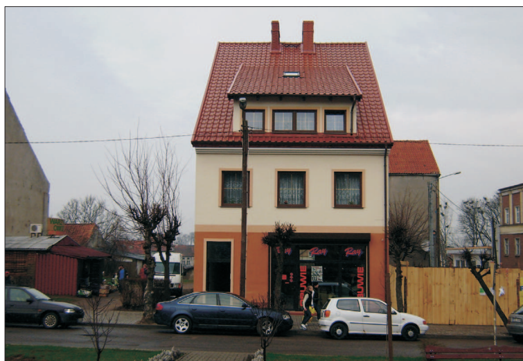
Fig. 3. Fragment of the north frontage of the Old Town Market Square