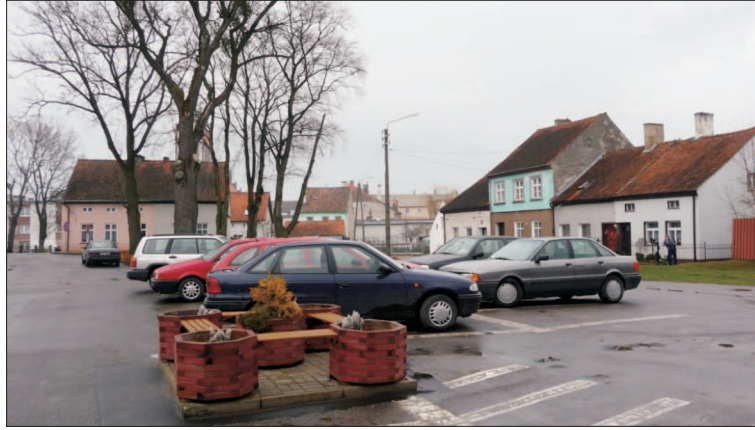
Fig. 7. Castle Square in Jeziorany – the current situation