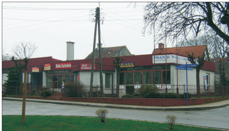
Fig. 2. Fragment of the west frontage of the Old Town Market Square