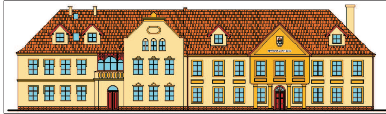
Fig. 12. The Town Council in Jeziorany – the revalorization concept Author: M. Adamczewski.

Among the greatest advantages of the planned revalorization of this building is the idea of assigning a new function to the medieval vaulted cellars underneath the building, the only surviving fragment of the former castle of the Bishops of Warmia. The project assumes that the cellars could be renovated and converted to house either a stylish restaurant or a registrar hall for wedding ceremonies.