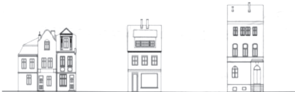
Fig. 5. The buildings along the north frontage of the square – the current situation

The arrangement of the townhouses with their roof ridges parallel to the streets, the small-scale houses and narrow land plots, the rhythm of doors and windows as well as historicizing details have all superimposed the way in which the new buildings completing gaps between the existing ones have been designed and the ones which disagree with the historic houses have been re-designed. Most of the proposed changes concern the west frontage of the square and new buildings in the north frontage. The designed architectural solutions draw on the historic buildings, and are therefore an attempt at connecting the rows of houses along each side of the market square (Figs 5, 6).