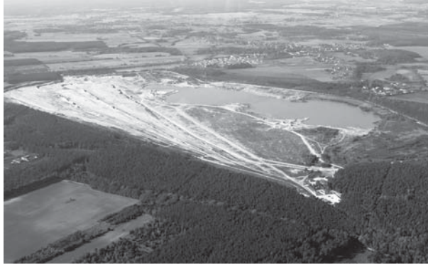
Fig. 5. “Obora” Sand Mine — present state.

The operating period for mining operations in the “Obora” mine is dictated by the existing mineral resources, and the demand of copper ore mines for filling material. The expected date of termination of operations is to be between 2022 and 2025 at the earliest. That date may be affected by the concept considered by KGHM of storage/backfill of excavations in copper ore mines using wastes from extractive industry.