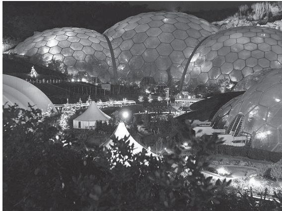
Fig. 3. Eden Project — botanical gardens in a former china clay mine, England.

The cease of industrial activity in industrial areas is, due to the scale of necessary reclamation and revitalisation work to be implemented, a task that requires considerable effort and financial resources. At the same time it gives an opportunity for using industrial facilities in interesting ways: excavations, heaps, and the characteristic technical infrastructure. The examples demonstrated here show that a well utilised industrial past of industrial areas gives them competitive advantages, not least because of the development of industrial and sentimental tourism. The diversity of industrial facilities in LGOM also creates an opportunity for interesting development of the area.