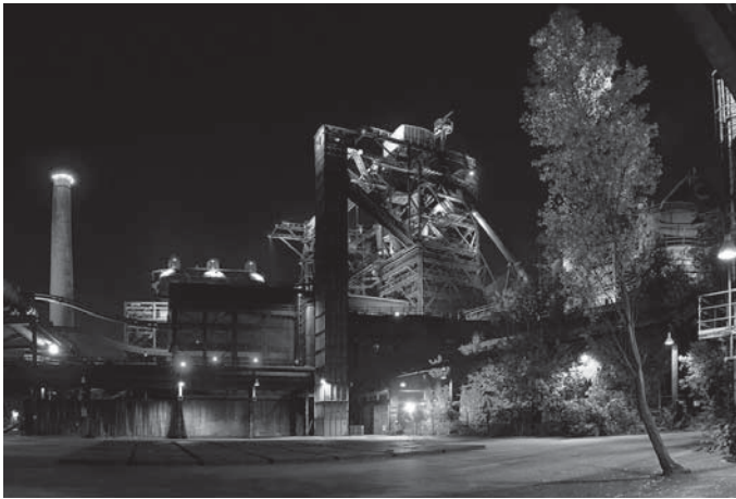
Fig. 1. Landschaftspark Duisburg Nord, Germany.

In addition to environmental and social measures (compensation for loss of jobs), it is typical for the process of revitalisation of European industrial regions that their implementation is based on multi-annual programmes, allowing for a comprehensive approach and harmony of functions. The establishment of a new image for the region and the search for new opportunities for economic development were also goals. This objective was accomplished mostly through the preservation of selected elements of industrial heritage and their adaptation to new functions, not just museums, but also cultural, sporting and economic facilities. The Ruhr area is an example of this as, thanks to well-organized processes of revitalisation, it has been converted into a region of culture and business, among others through projects such as Landschaftspark Duisburg Nord set up in a former foundry which now functions as a museum, cultural and sport centre, but is also a characteristic component of the landscape of the Ruhr Area (Fig. 1).