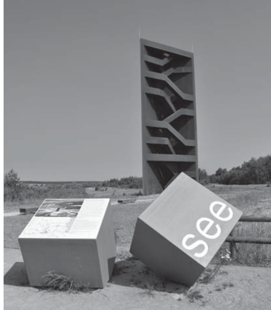
Fig. 2. Lookout point over the Sornoer Channel, Germany.