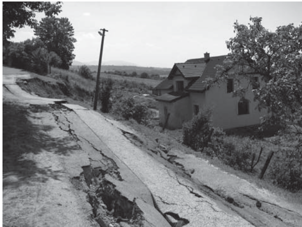
Fig. 3. A new house tilting in the main scarp zone of the activated landslides in Nižná Myšľa

The new municipality plan of Nižná Myšľa was drafted in 2008 and allowed for the construction of new buildings on the territory of the landslide, which was activated in 2010. In case of later reactivation of the landslide in Nižná Myšľa, the landslide would have resulted most likely in damage of greater amount of objects.