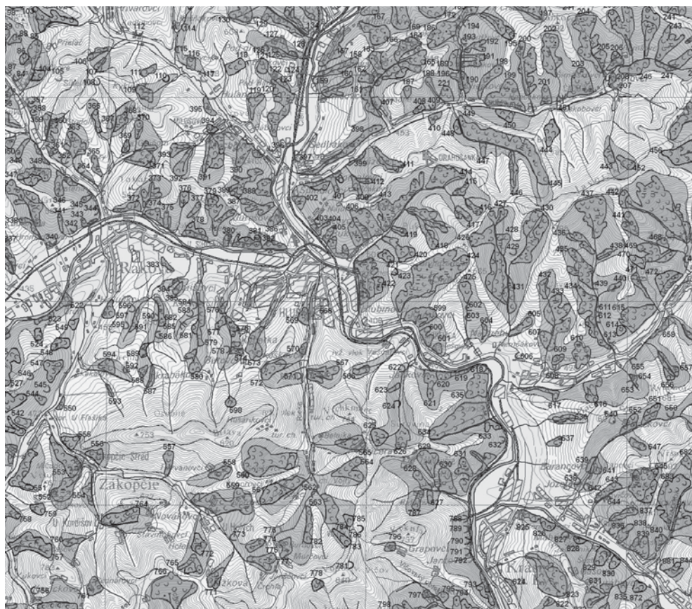
Fig. 1. Cut-sheet of the map (near town Čadca) from the “Atlas of landslides” [2]

and is outlined or marked by a point. Expected landslide activity is expressed by color. Type of slope deformations in terms of a simplified classification by Nemčok, Pašek, Rybář [3] is denoted by hatches.