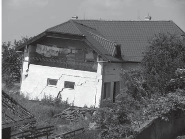
Fig. 3. New residential house damaged in the area of the main scarp on the landslide in Nižná Myšľa

Ignoring this data could result in enormous economic losses. An example can be taken from the village Nižná Myšľa, where in 2010 after the activation of landslides have damaged 45 homes, of which 32 were completely destroyed statics and had to be demolished. 144 people were evacuated [1]. In addition to the destruction of older buildings new objects were also completely destroyed (Fig. 3 and 4) which were built after 2007, when the Atlas of landslides was already available.