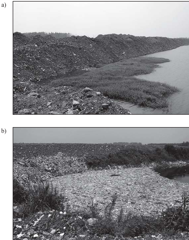
Fig. 1. Some non-point sources of subsidence area: a) coal gangue road of the subsidence water pond; b) waste of the subsidence water pond

Pollution sources of subsidence water area Xu Yan, Huainan and Huaibei region include point sources and non-point source, and some pollution sources were shown in following pictures (Fig. 1 and 2).