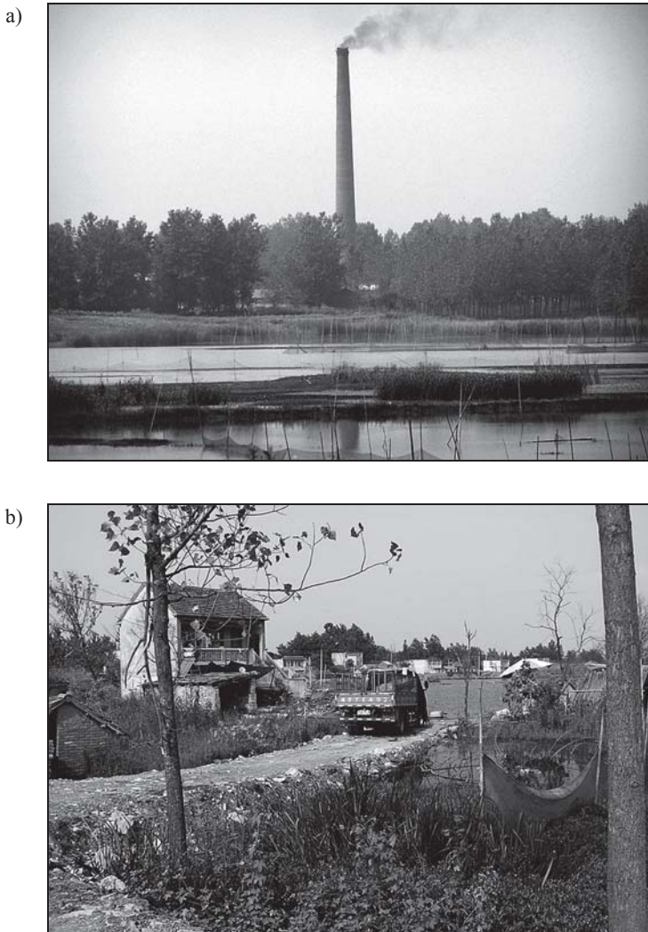
Fig. 2. Some point sources of subsidence area: a) chimney of kiln plant; b) sewage of residents around the subsidence area

Point-sources around subsidence water area include the industry pollution which are domestic waste water effluent from sewage treatment plant in the coal mine, the coal washing waste water, mine drainage, and other coal industry [8–10].