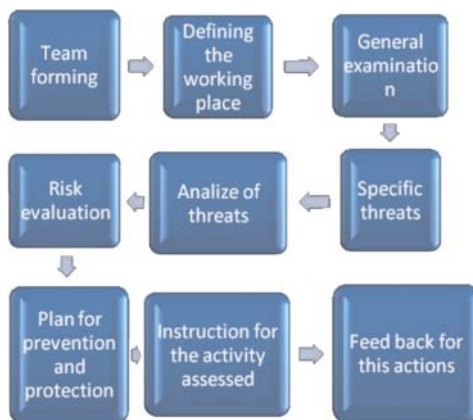
Figure 1. The general procedure scheme

The general procedure for this assessment is briefly presented in figure 1: