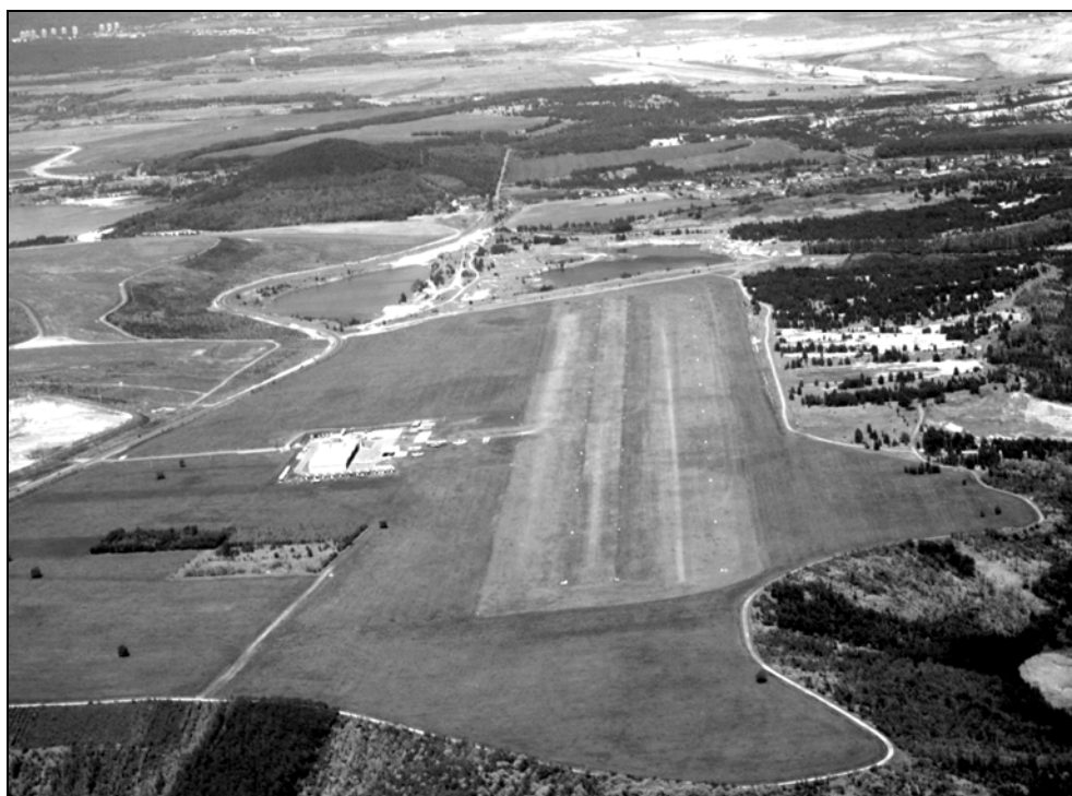
Fig. 2. The restoration of dump surface (locality Strimice)

The Strimice dump reclamation has been completed. At the crown of the dump an airport with ca 90 ha surface surrounded with agricultural reclamation serves to the Most citizens. On the slopes of the dump forestry reclamation with tourist trails (Fig. 2) were built.