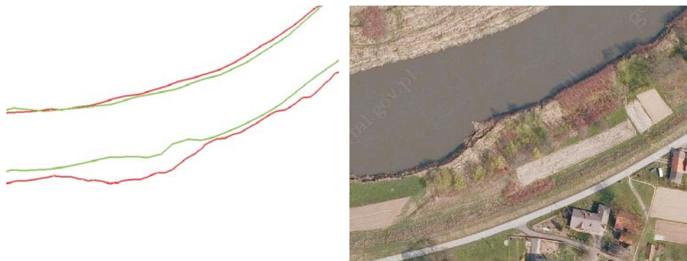
Fig. 3. Change of shape of the river-bed in years 1977–2009, section between cadastral units Czernichów and Pozowice