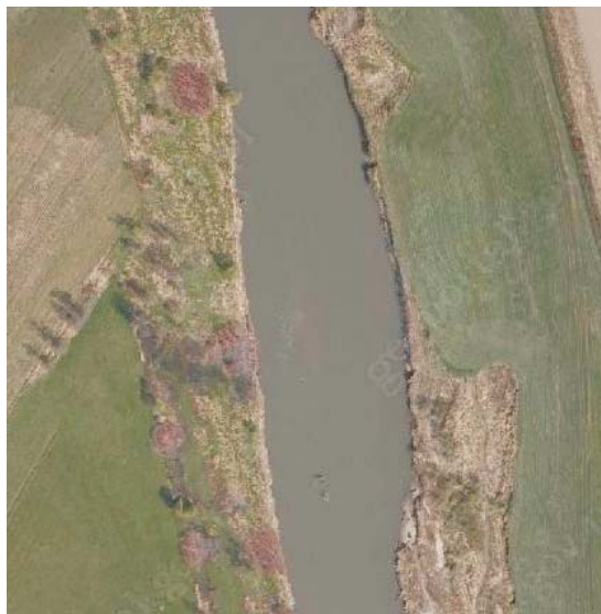
Fig. 1. Change of shape of the river-bed in years 1977–2009, section between cadastral units Czernichów and Pozowice