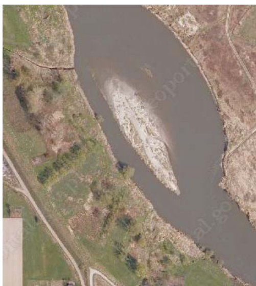
Fig. 2. Change of shape of the river-bed in years 1977–2009, section between cadastral units Wołowice and Pozowice