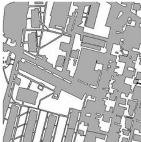
Fig. 3. Sample result of impervious surfaces vectorisation on the aerial orthophotomap

Fifteen testing fields (300 m × 300 m) have been selected for training and verification data. They include different kinds of urban, suburban, rural, industrial and commercial areas. Impervious surfaces have been derived in photo interpretation process from orthophotomaps for both time periods (Fig. 3).