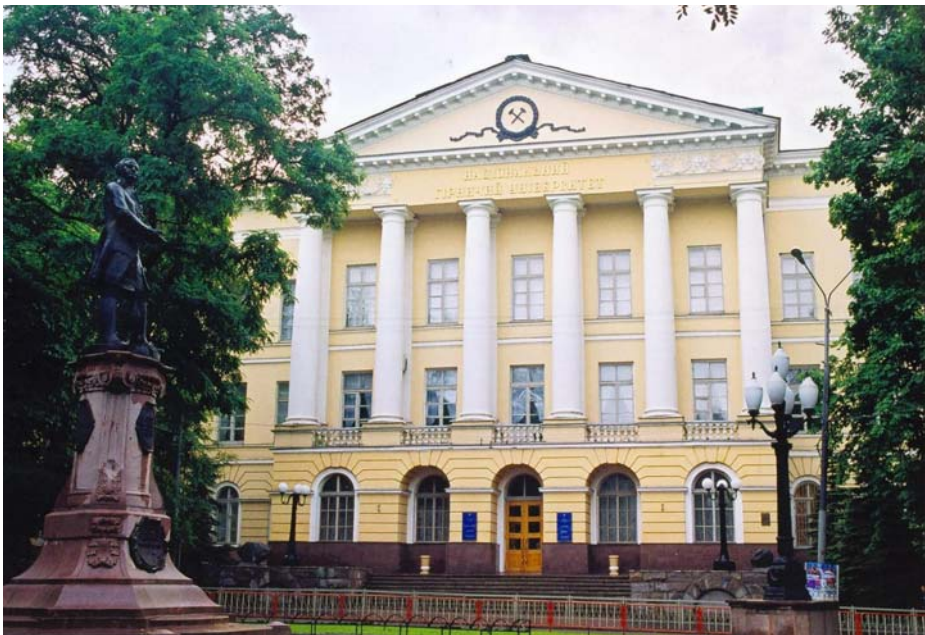
The main building of the National Mining University