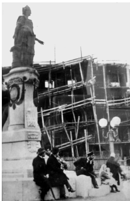
Construction of main building of Katerynoslav Higher Mining Technical School

nued due to the scientific qualification of the teaching staff and its interactions with pits, mines and metallurgical plants situated nearby (Kryvyi Rih, Donbas, Katerynoslav) in combination with modern scientific and technical level of the laboratories.