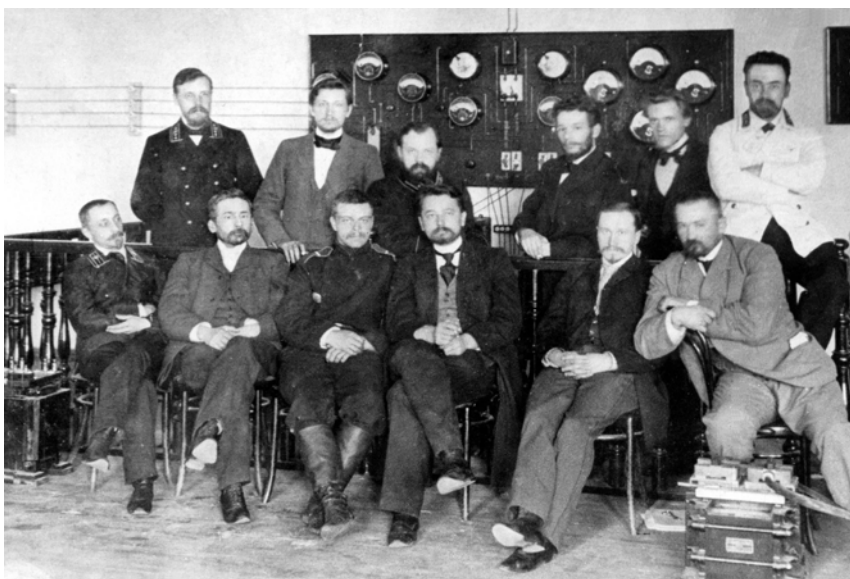
The first teaching staff, 1901.

The Dnipropetrovsk Mining Institute was an instrumental organizer of other institutions, such as: the Dnipropetrovsk State Medical Academy (1920), the State Metallurgical Technical University of Ukraine and the Ukrainian State University of Chemistry and Technology (1930), the Moscow Welding Institute (1925), the North Caucasian Mining and Metallurgical Institute (1931), the Scientific Research Tube Institute (1929), the Scientific Research Mining Institute (1925), the Institute of Physical Chemistry of the National Academy of Sciences of Ukraine (1927), the Institute of Mining Mechanics of the National Academy of Sciences of Ukraine (1945), the Scientific Research Institute of Coal (1928), the Institute of Rock Mechanics of the National Academy of Sciences of Ukraine (1967), and the Institute "Dniprodiproshakht" (1928).