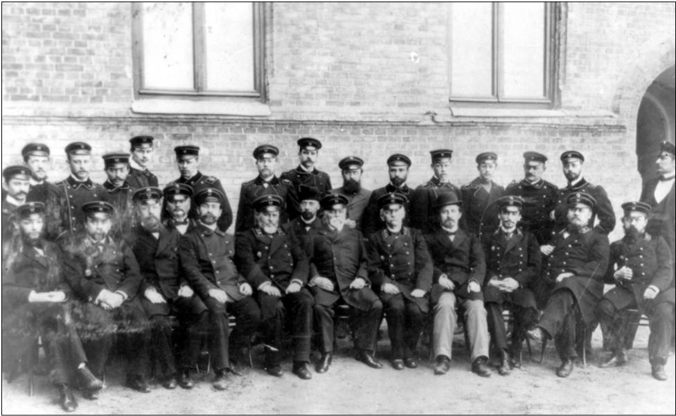
Teachers and students of Katerynoslav Mining Institute, 1914