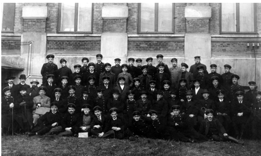
The teacher and students of Faculty of Mining Art, 1916

Constant interest in industrial experience, participation in commissions investigating large failures in mines has allowed him to write some articles on safety in mining. As a result a four-volume capital work "Description of Donetsk Basin" had been published. All members of the FMA participated in its creation.