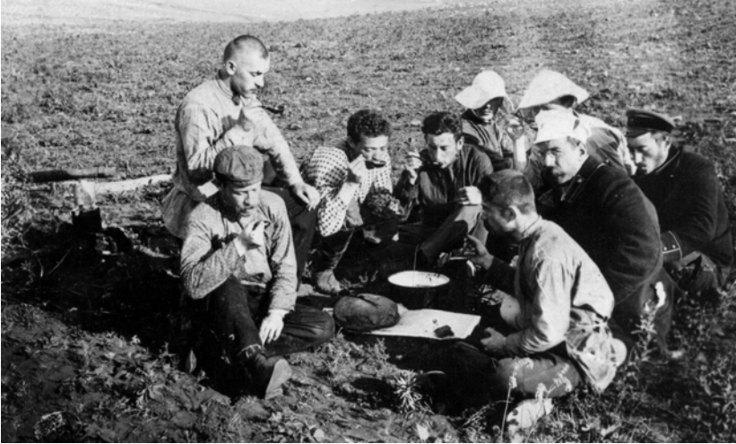
Geological practice in Crimea, 1901

Particular attention was paid to practical studies. After completing their first-year of study the students went on a 10–15-day trip to the mines of Donbass or mines of Kryvij Rih. In a railway car specially equipped for such excursions the student's group led by teachers arrived at the mines. During this time students got acquainted with underground work and mine constructions, collected information describing the seams and the methods used for their extraction. The collected materials were used in educational process. Teachers helped students to come into business contacts with the mine administration, communicate with workers, get answers to their most pressing questions, and get acquainted with recent achievements of coal mining technology.