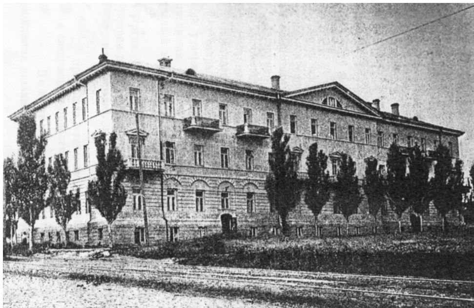
Professor's apartments, 1912

The process of reforming the technical school was accompanied by rough enough performances of students. This process began in the beginning of 1911 and proceeded right to the beginning of the revolution (1917).