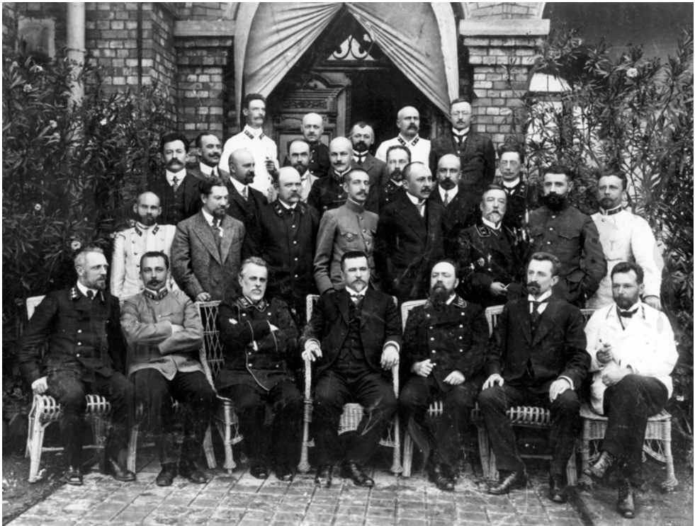
Commission on mining, 1912