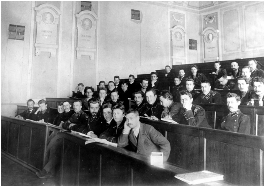
Students on lecture, 1914