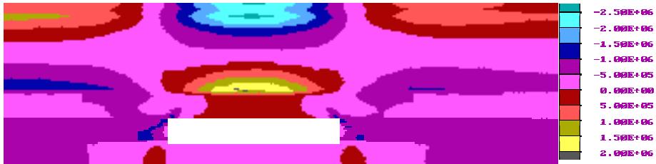
Fig. 1. Stress distribution in the first breakage of the key stratum with the mining height of 4 m

The break rule of the key stratum was studied using the numerical simulation software (FLAC2D) in shallow seam. The strike length of the design model was 100 m, its mining height was 2 m and 4 m respectively, its simulated vertical height was the same as the thickness of the base rock. The loose beds on top of the base rock were represented on the top border of the model in the form of uniformly distributed load, and the magnitude of the load was equal to the weight of the loose beds. According to differentiating key stratum program, the serial number of the key stratum (as Fig. 1 indicates) was 8 in 1203 face of Daliuta mine. The rock property was siltstone, and its thickness was 2.2 m. The model adopts Mohr – Coulomb plasticity model, and the key stratum break is on the basis of the tensile failure.