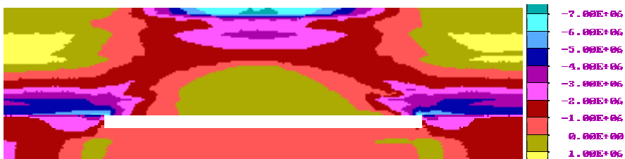
Fig. 2. Stress distribution in the overburden rock with the mining height of 2 m

With the mining height of 2 m, the key stratum stress translates into the tensile stress from the compressive stress with the face advancing. However, with the face advancing to a distance of 60 m, the slide doesn't appear in the key stratum. The stress distribution in the overburden strata is presetned in Figure 2. With the mining height reduced, the structure slide doesn't occur in the key stratum, and the falling crack failure doesn't appear among the overburden strata, since the cracked blocks of the immediate roof fill the gob area during mining exploitation.