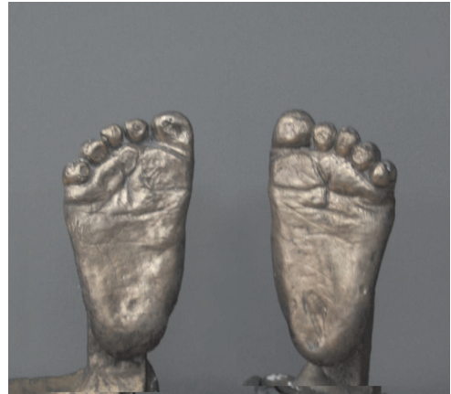
Fig. 2. Baby feet replicated by Lifecasting: a) wax patterns; b) bronze castings