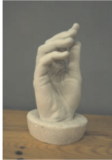
Fig. 1. Plaster casting of hands