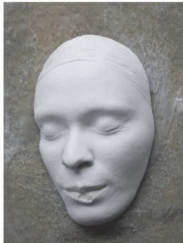
Fig. 7. The plaster casting obtained from the alginate matrix

Lifecasting is a method by which one cannot obtain a metal casting directly, therefore it has been necessary to employ a supplementary method, namely the investment casting.