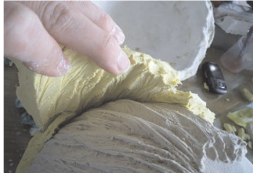
Fig. 10. Removing the mould from the plaster replica: a) from the face; b) from the hair