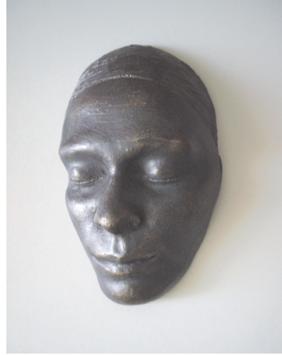
Fig. 9. The bronze casting obtained by the lifecasting method

The material used for building a full, block ceramic mould for metal casting has been plaster for pattern making, silica sand, and water. Mixed components have been degassed in the HYPERVACUUM 50 vacuum chamber made by Mario di Maio Company. Then the mixture has been poured onto the previously prepared wax pattern set and left for 24 hours to achieve the full setting of the material. The wax pattern has been melted in a laboratory drying oven at the temperature of 200 °C for 8 hours. Subsequently the mould has been placed in the furnace for heat treatment and has been heated at first at the temperature of 550 °C for 4 hours, then at 740 °C for another 4 hours. After finishing the burnout process, the mould has been cooled with the furnace down to 380 °C and transferred to the pouring stand.