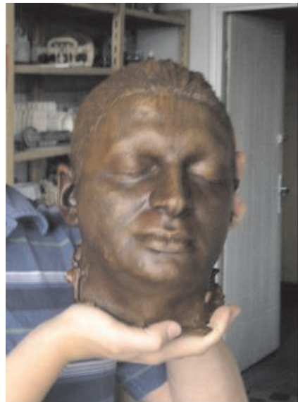
Fig. 12. The bronze casting of man's head obtained by LC method