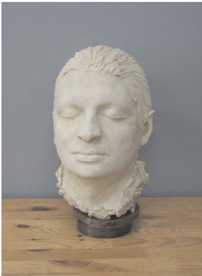
Fig. 11. The replica of the model