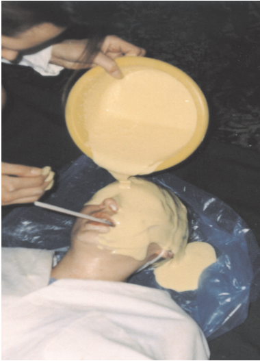
Fig. 4. Applying the alginate mixture on the greased face

strengthened with a casing of plaster for pattern making. The corrections have been made using stomatologic plaster of the same hardness, but of different colour to make them easy to distinguish.