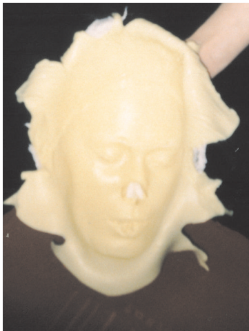
Fig. 6. The alginate matrix No. 1