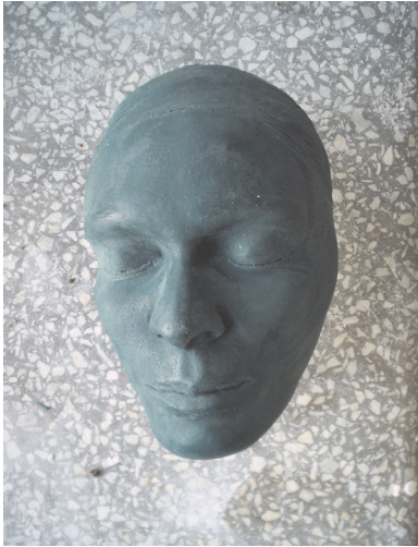
Fig. 8. The prepared wax pattern

Further work consisted in preparing the rigid-elastic matrix (No. 3 mould) from the plaster replica No. 2. This third mould has been made of the above mentioned rubber and catalyst. After the curing process had been finished, the mould has been strengthened with a plaster casing. The No. 3 mould has been used for production of wax replicas made of the commercially available 'CASTALDO' wax (Fig. 8).