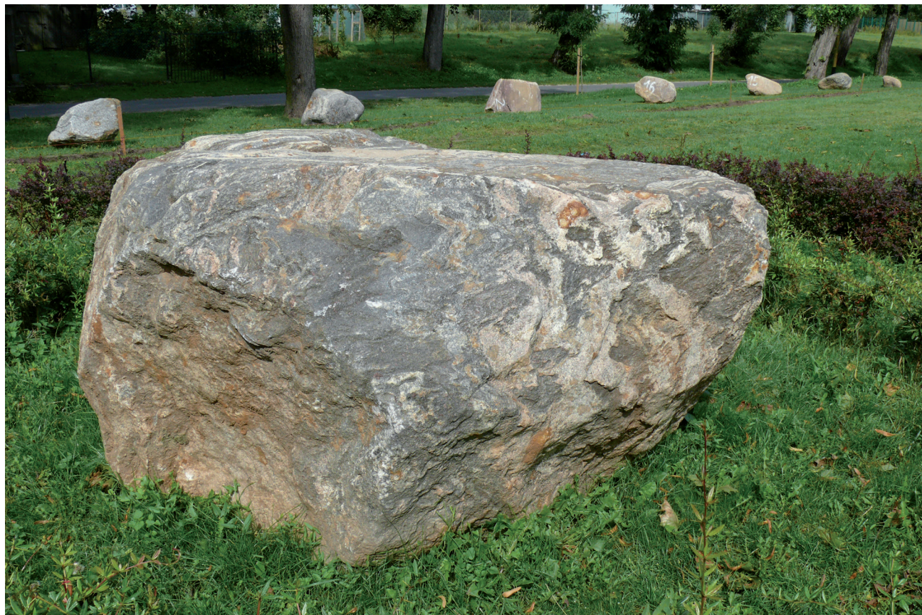
Fig. 5. Boulder No 34 in the petrographic garden in Moryń resembles a sacrificial table in shape; the boulder is a gneiss with beautifully developed stylolite folds – visible in the photograph