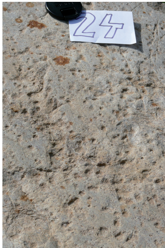
Fig. 4. Tafoni – small cave-like features of honeycomb weathering – on the surface of Jotnian sandstone (boulder No 24)

Six indicator erratics, meaning those rocks of known Scandinavian provenance, can be found among the errat-