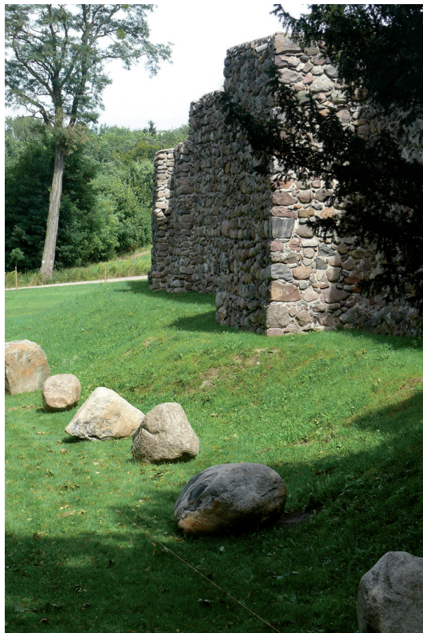
Fig. 3. Fragment of the petrographic garden at the foot of the fifteenth-century city walls in Moryń

The location of the boulder collection in Moryń is not accidental. It is here where the centre of management of the future geopark Kraina Lodowcowa nad Odrą has its seat (Dobrcki 2011). A tourist, having visited the permanent exhibition of the geopark presented in the building next to the City Office, may take a two-minute-long walk westward along Żeromski street, reach the city gate and, behind the gate, to the right at the foot of the city walls (Fig. 3), can notice 35 erratics (another ten boulders are just being prepared for determination and description), arranged along two parallel lines. In the middle of the collection are two bigger erratics; one placed close to the flower bed (Fig. 2).