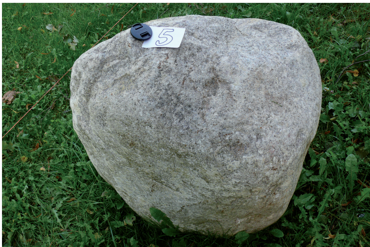
Fig. 6. Boulder No 5 – a pebble – gained its shape in the high-energy environment, most probably in the subglacial tunnel