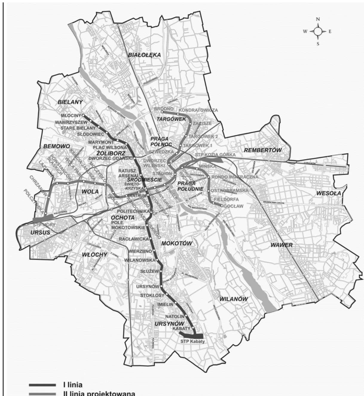
Fig. 2. Current metro line (dark line) and scheduled (lighter lines) Rys. 2. Obecna linia metra (czarna linia) i projektowana (jaśniejsza)

The existing metro network and stations in Warsaw are all located underground and the stations have large dimensions. The fact is that there is no urban space available at the surface to build a network with different features. Although Warsaw Metro is not as commonly used as desired, the reason for this is that other urban modes are better developed in the city and the city coverage of the metro system is still very limited and lacks of capacity. Although Warsaw Metro carries 568,000 passengers per day, the most efficient and modern public transport mode in Warsaw is actually a light rail system, called SKM. In terms of frequency, trains are running every 15 minutes, almost constantly during all day.