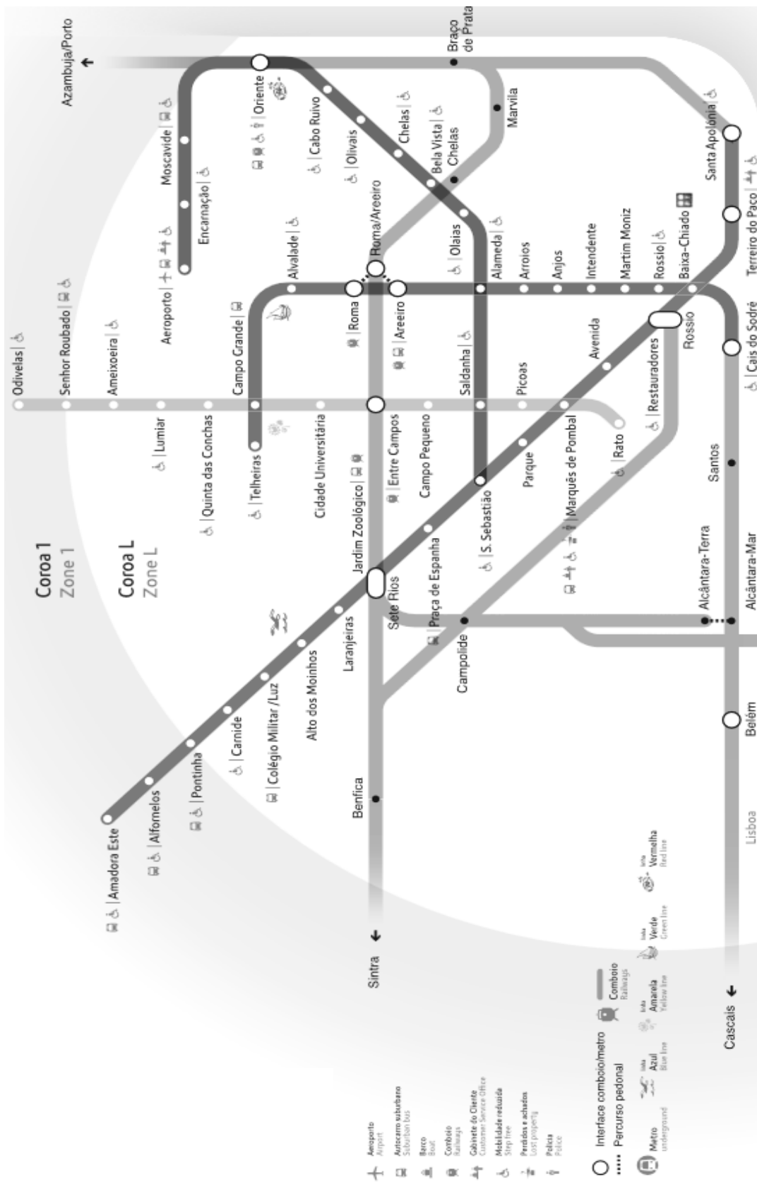
Fig. 3. Lisbon Metro network diagram Rys. 3. Plan metra w Lizbonie