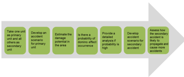
Figure 3. Domino Effect Analysis (DEA) procedure

The Domino Effect Analysis procedure is illustrated in Figure 3 .