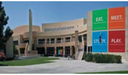
California State Polytechnic University, Bronco Student Center