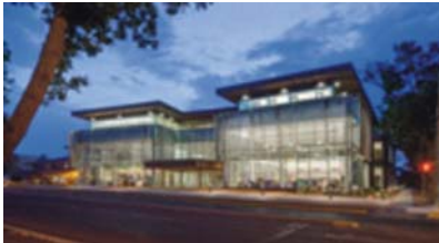
New Mexico Highlands University, Student Center, Las Vegas