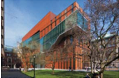
Barnard College – Diana Center New York, NY