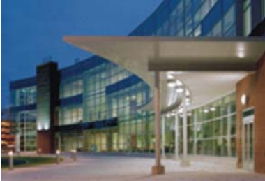
Eastern Michigan University, Student Center