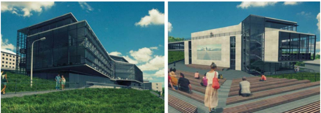
il. 4. The view of Inter-collegiate cultural center at the intersection of Academic Sakharov and Kniagynia Olha streets in Lviv