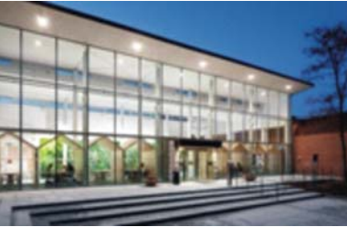
Karolinska Institutet – Future Learning Environment Solna, Sweden