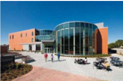
Hamline University, Anderson University Center