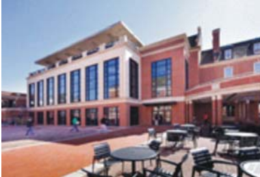
Oklahoma State University, Student Union