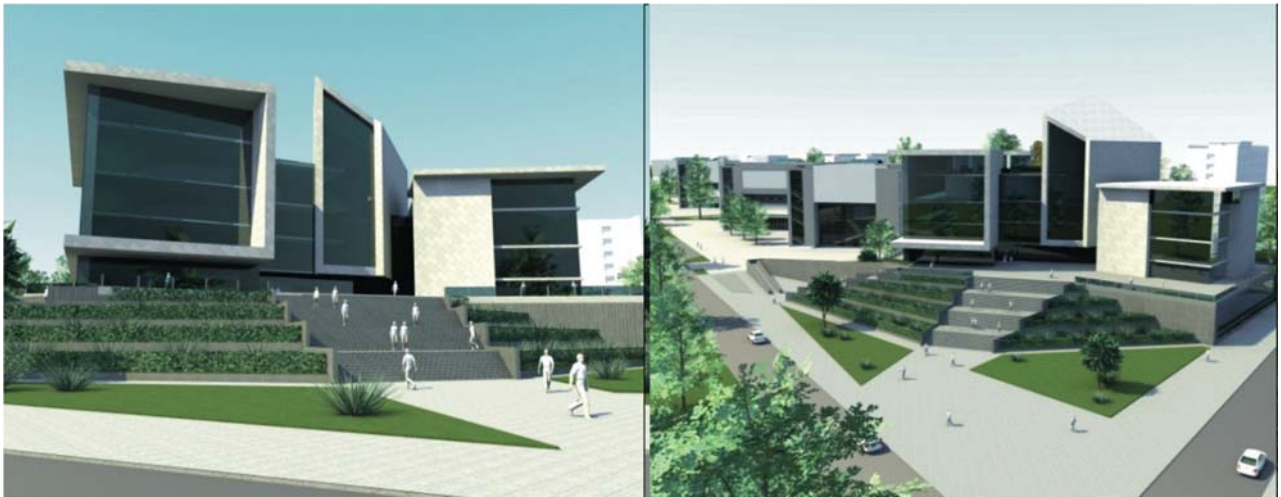
il. 3. View of projected university culture center at Kielce, Poland

The next step was the project of university culture center in the environment of campus of Kielce University of Technology, Poland (il. 3). A detailed analysis of the site was undertaken and an optimal place for positioning the projected center was determined. The building also has the function of the visual domination of front of university buildings from the 70s years of past century.