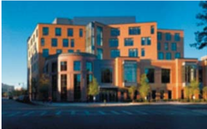
Boston University, Student Services Center