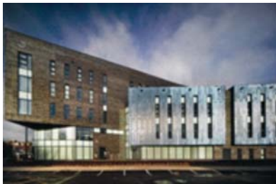
University Centre at Blackburn College