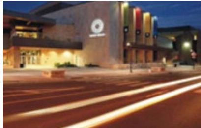
University of Wisconsin, Union South