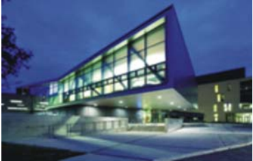
Scarborough Student Centre, University of Toronto