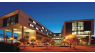
University of California, San Diego the Price Center