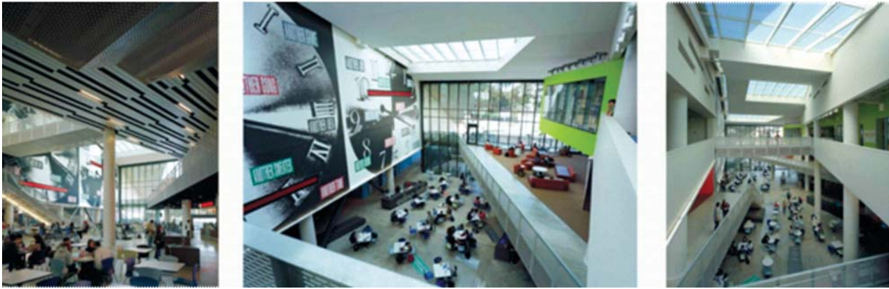
Il. 1. Civil space created for students' free time. Students' center of San Diego University, California, USA

The inter-college culture object, same as university culture center – are new and little-known architectural vocabulary terms. Overview of design and construction experience of such centers allows to analyze spatial, volume and planning solutions, fillings with functional zones, determine principles of their arrangement in the structure of the university and the city generally, and create principles of architectural typology of these public buildings.