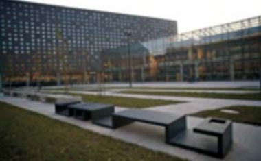
The Integrated Student Center, Wroclaw University of Technology