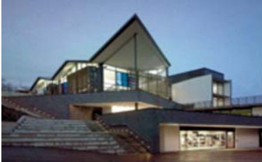
University Centre Hampshire, England, UK