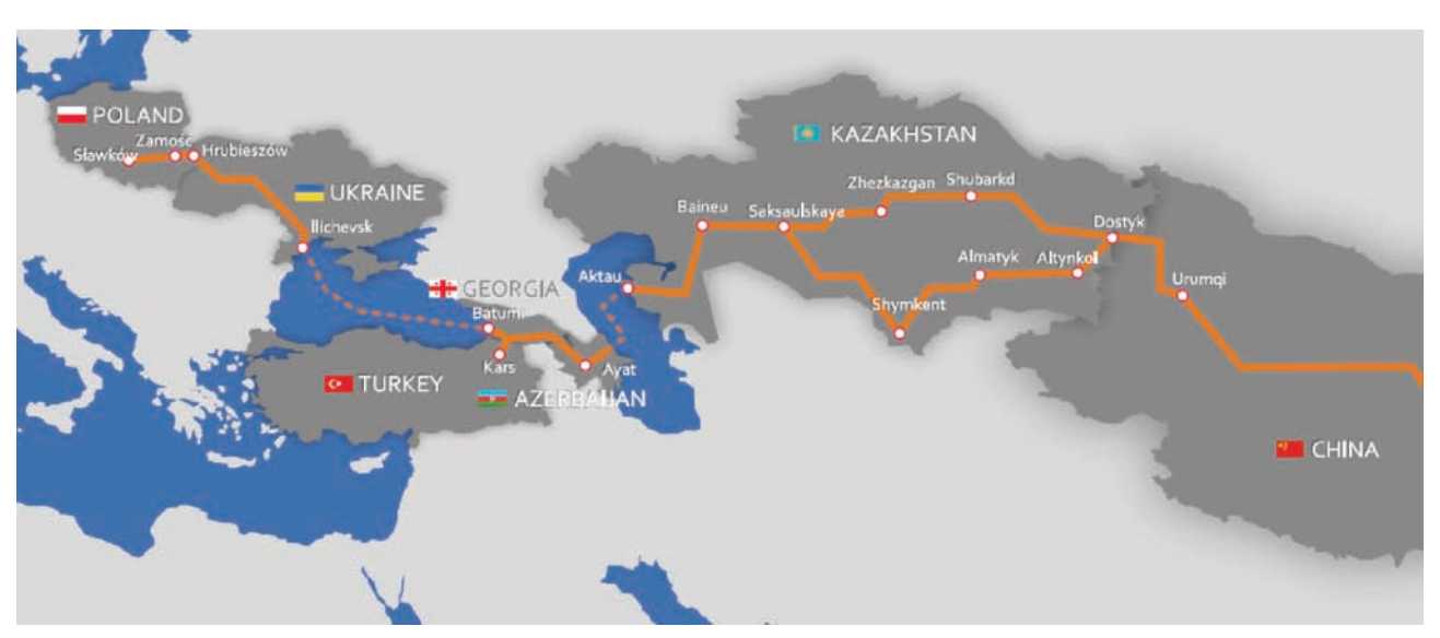
Fig. 3. The TMTM corridor [9]