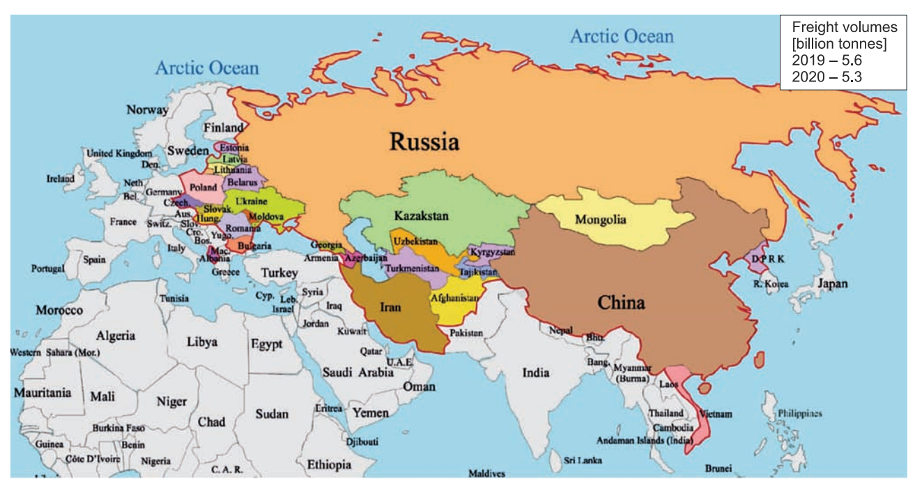
Fig. 6. Freight volumes in the OSJD countries [8]

per day. This encourages the development of transit services. The main routes and directions are Asia – Europe – Asia.