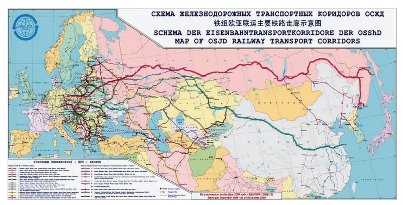
Fig. 2. The OSJD transport corridors [7]

The organisation and development of rail transport along the OSJD corridors significantly facilitate border crossings both from a technical, legal and administrative point of view, thereby significantly reducing train stopping times at borders and, as a result, overall journey times. Attention should also be paid to