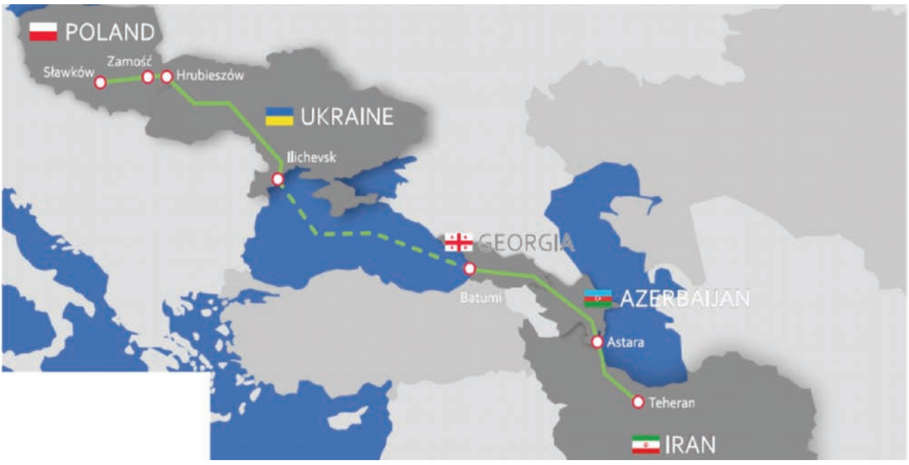
Fig. 4. The corridor from Iran [9]

Despite the complex conditions associated with the coronavirus pandemic, the booming container traffic on the New Silk Road is not surprising, as shown in Figure 5.