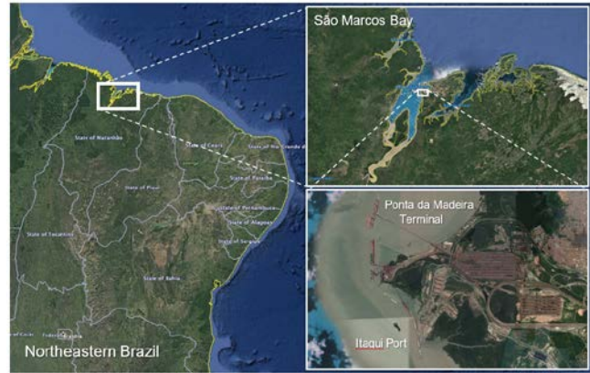
Figure 2. São Marcos Bay area in Gulf of Maranhão, State of Maranhão, Brazil.

São Marcos Bay is the largest Brazilian bay. It is approximately 500 km long, 100 km wide and it is bordered by the mainland (to the west), the city of São Luís (east) and the mouth of the Mearim River (south). Due to its natural great depth (which allows receiving 23 m draft ships) and wave protection aspect, this region's port potential is known at least since 1612, when French invaders established the first port of São Luís. Nowadays, several important ports are set within São Marcos Bay area, among which are the Itaquí Port and the Ponta da Madeira Terminal. Figure 2 shows their location.