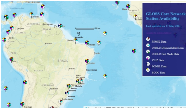
Figure 1. Site location of Brazilian main tidal stations network (adapted from GLOSS).

It has long been suggested that the use of a period of at least two lunar nodal tide cycles (encompassing 37.2 years) for proper sea level assessments is highly recommended [10, 15]. As there is usually a strong interest in extrapolating the trend detected with past data, it is also important that the records extend to dates as close to the present day. Only four tide stations located on the Brazilian coast meet these requirements, Gulf of Maranhão (MA), Ilha Fiscal (RJ), Santos (SP) and Cananeia (SP).