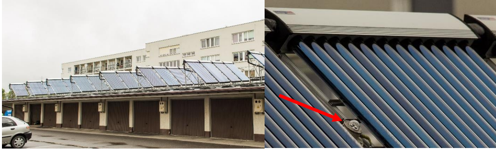
Fig. 1. Installation – left side, pyranometer mounted between pipes – right side

Rys. 1. Instalacja – lewa strona, pyranometr montowany między rurami kolektorów – prawa strona