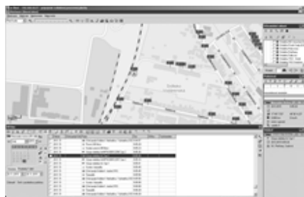
Fig. 4 SW application Rys. 4 Aplikacja SW

containers itself is carried out by industrial high powered reader with adjustable power and special antennas. UHF RFID reader used in the described system is called Impinj Revolution R 420. The reader has four antenna connectors of which only two are used to connect to two linearly polarized UHF RFID antennas of the type H86-AD with the gain of 1,5dBi tuned for the frequency band 865–870MHz. High reader sensitivity of -84 dBm allows us to ensure high level of RFID tags readability. The reader power is adjustable in the range of 10 to 31.5 dBm so as to allow the precise identification of only the raised container and not the surrounded ones. Reader is together with other electronics placed in the anti-vibration box with the IP65 protection certification and dimensions 300x250x150 mm. The reader is powered via connection to the vehicles onboard electrical distribution system with 12/24 V converter, capable of supplying power of 15 W.