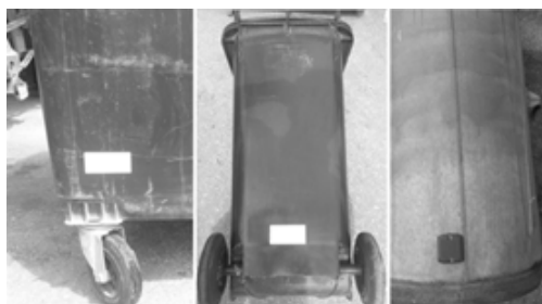
Fig. 1 RFID tags on plastic and metal container