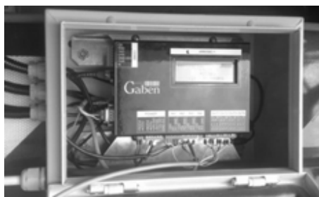
Fig. 3 Industrial computer for data collection and processing Rys.3 Przemysłowy komputer dla zbierania i przetwarzania danych