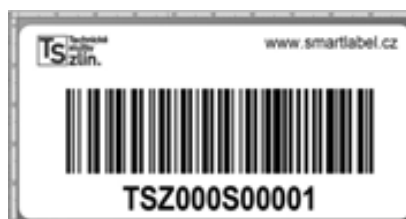
Fig. 2 Smart label for plastic waste collection containers design