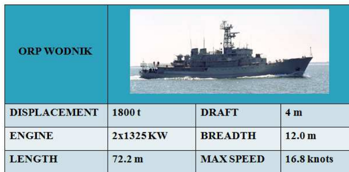
Fig. 2. Vessel characteristics [own study]

According to the conception it is assumed that the tests are performed by two main stages. The first of them are manoeuvring trials carried out in real conditions. At this stage the vessel's manoeuvrability at various meteorological conditions is to be analyzed. For this purpose RP Navy vessel ORP 'Wodnik' is to be used; the basing parameters of the vessel are presented in Fig. 2.