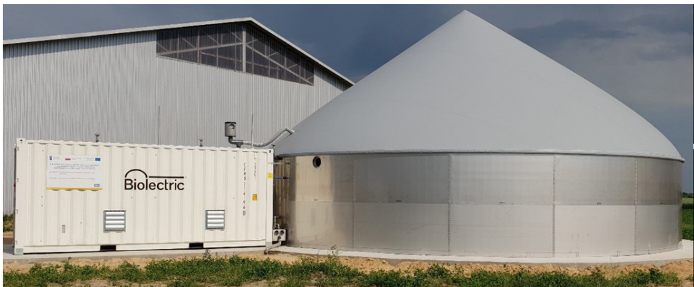
Fig. 1. BIOELECTRIC® 33 kWe installation example: Warmian-Masurian Voivodeship

BIOELECTRIC NV based its technology on single-silo (Fig. 1) mesophilic fermentation, carried out in a cylindrical vertical reactor, with a biogas buffer located directly above the mirror of the fermentation mass (under the double membrane flexible roof). The cogeneration and control system is installed in a 20 ft DV container, factory-connected to the wall of the digester. It contains the direct control set-up of the supply and outflow system from the reactor, its heating and mixing systems.