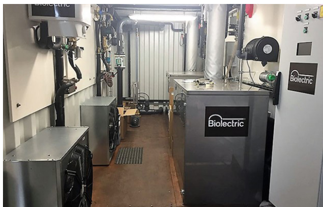
Fig. 3. The interior of the BIOELECTRIC® cogeneration container (own source)

The construction of the cogeneration container (Fig. 3), assembly of the reactor and realization of connections are carried out by a specialized installation team, and the start-up of the microbial fermentation process is carried out by the monitoring and control centre.